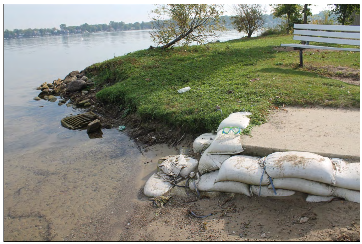
Lakeshore east beach end meeting shoreline (Sept. 2017)