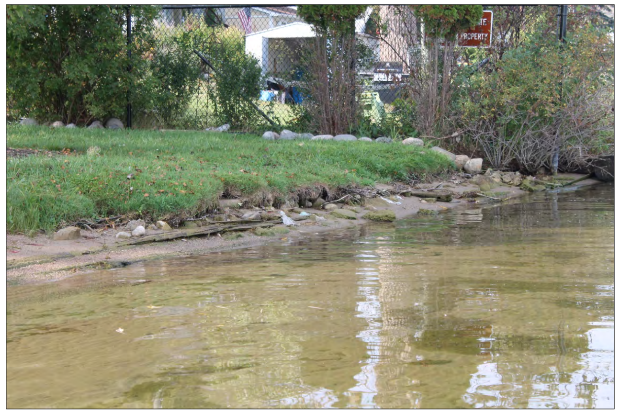
Lakeshore west shoreline (Sept. 2017)