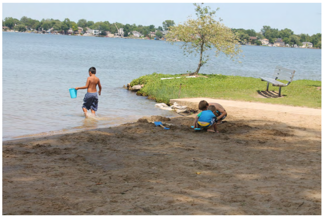
Lakeshore east beach end meeting shoreline (July 2015)