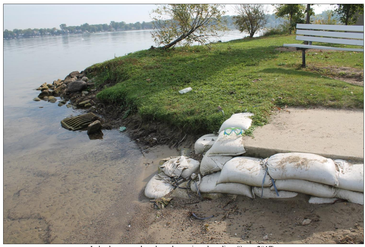
Lakeshore east beach end meeting shoreline (Sept. 2017)