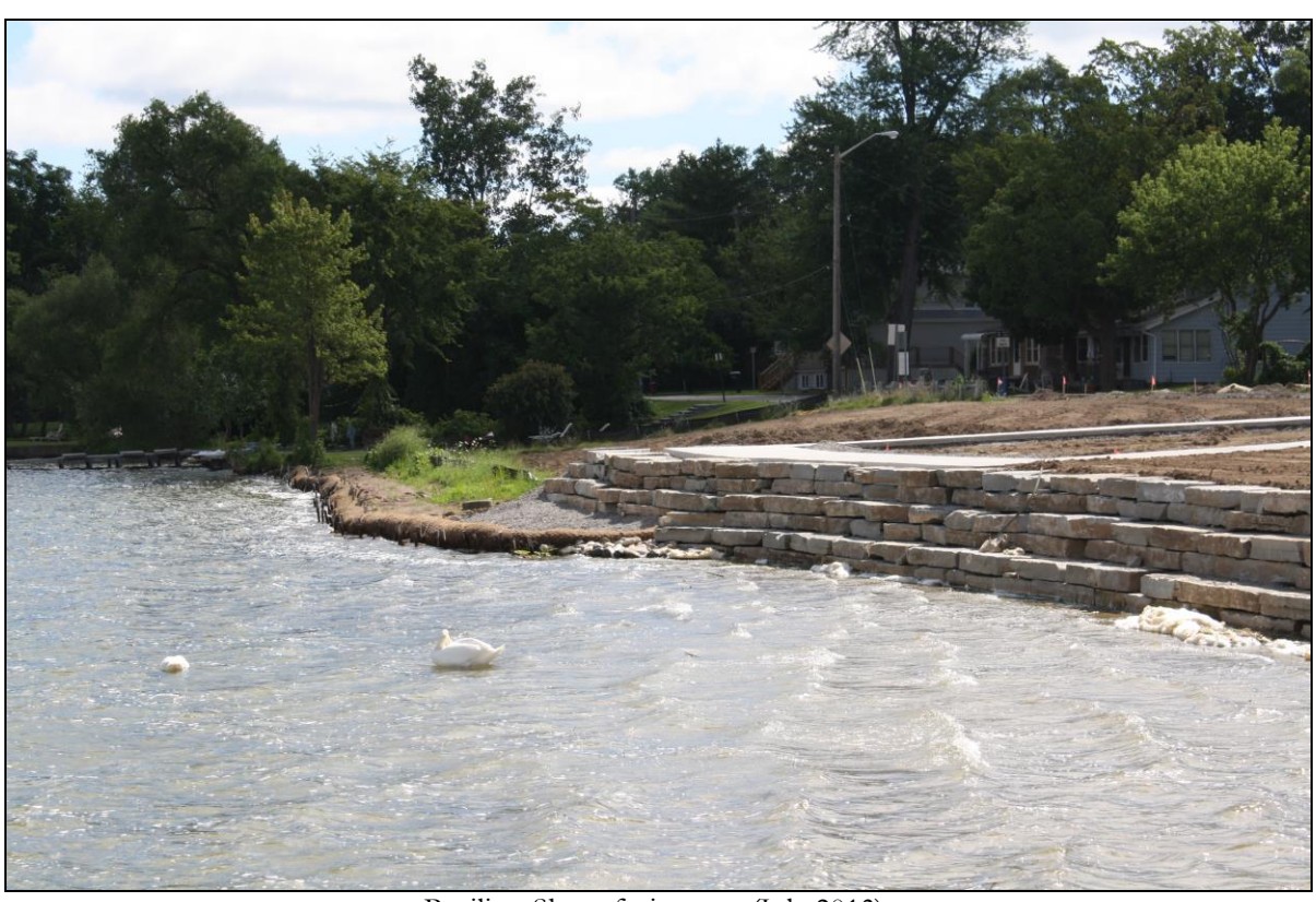
Pavilion Shore facing east (July 2013)