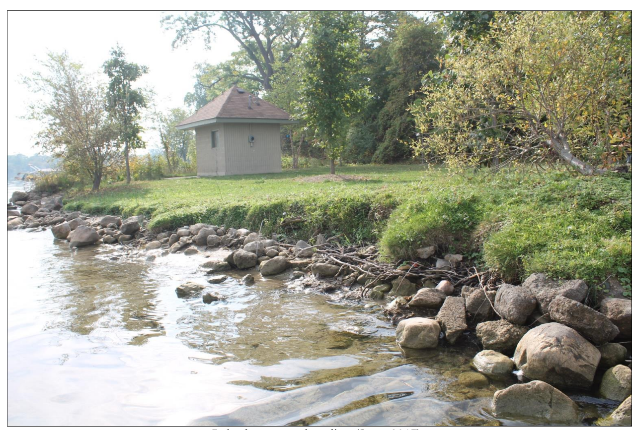
Lakeshore east shoreline (Sept. 2017)