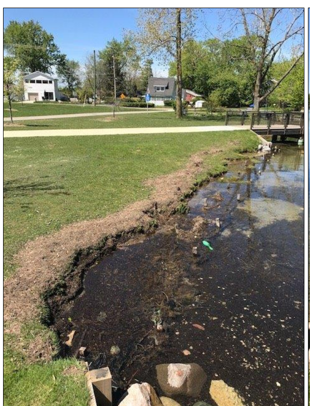
Pavilion Shore facing west (Sept. 2017)