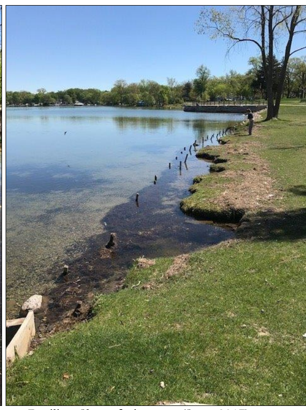
Pavilion Shore facing east (Sept. 2017)