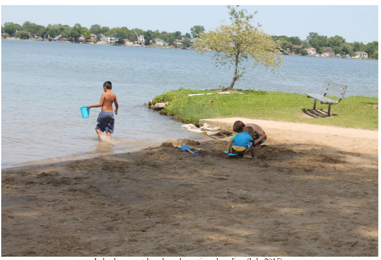
Lakeshore east beach end meeting shoreline (July 2015)