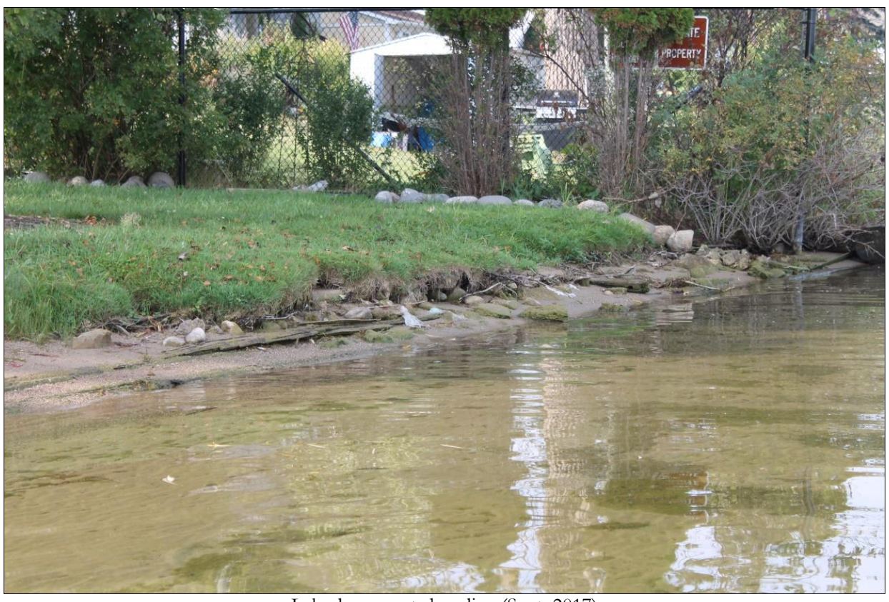
Lakeshore west shoreline (Sept. 2017)