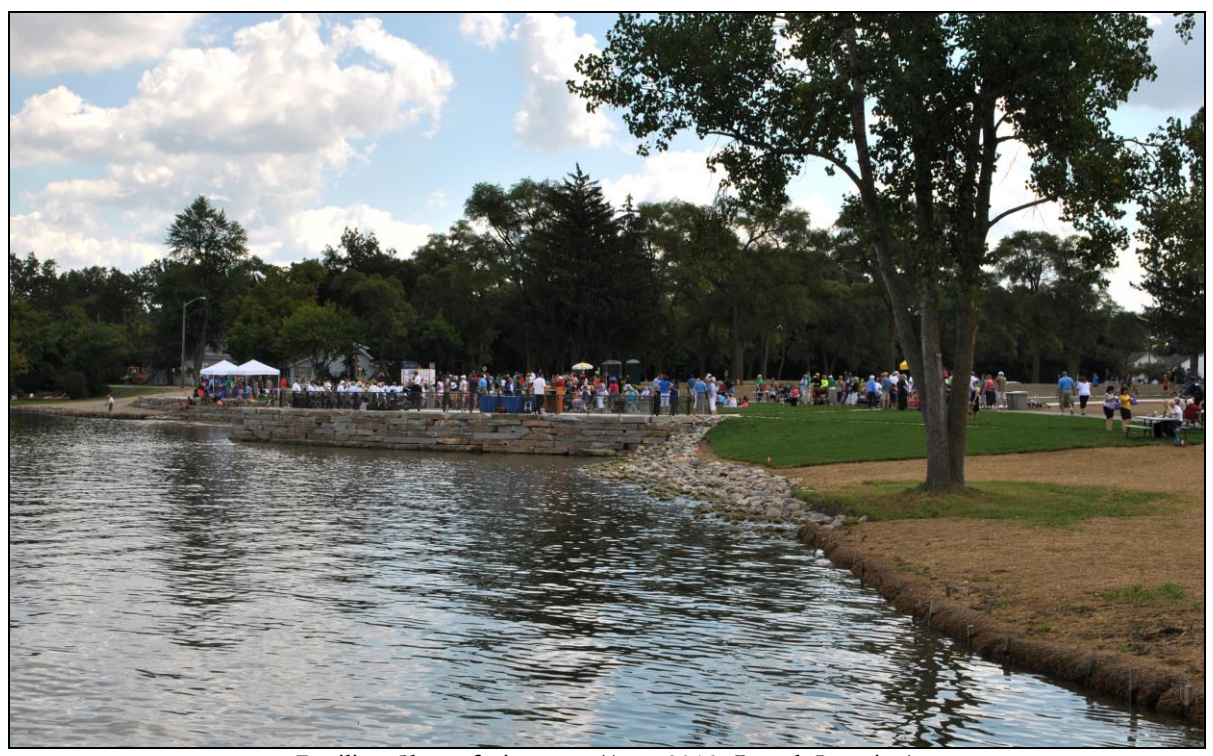
Pavilion Shore facing east (Aug. 2013 Grand Opening)