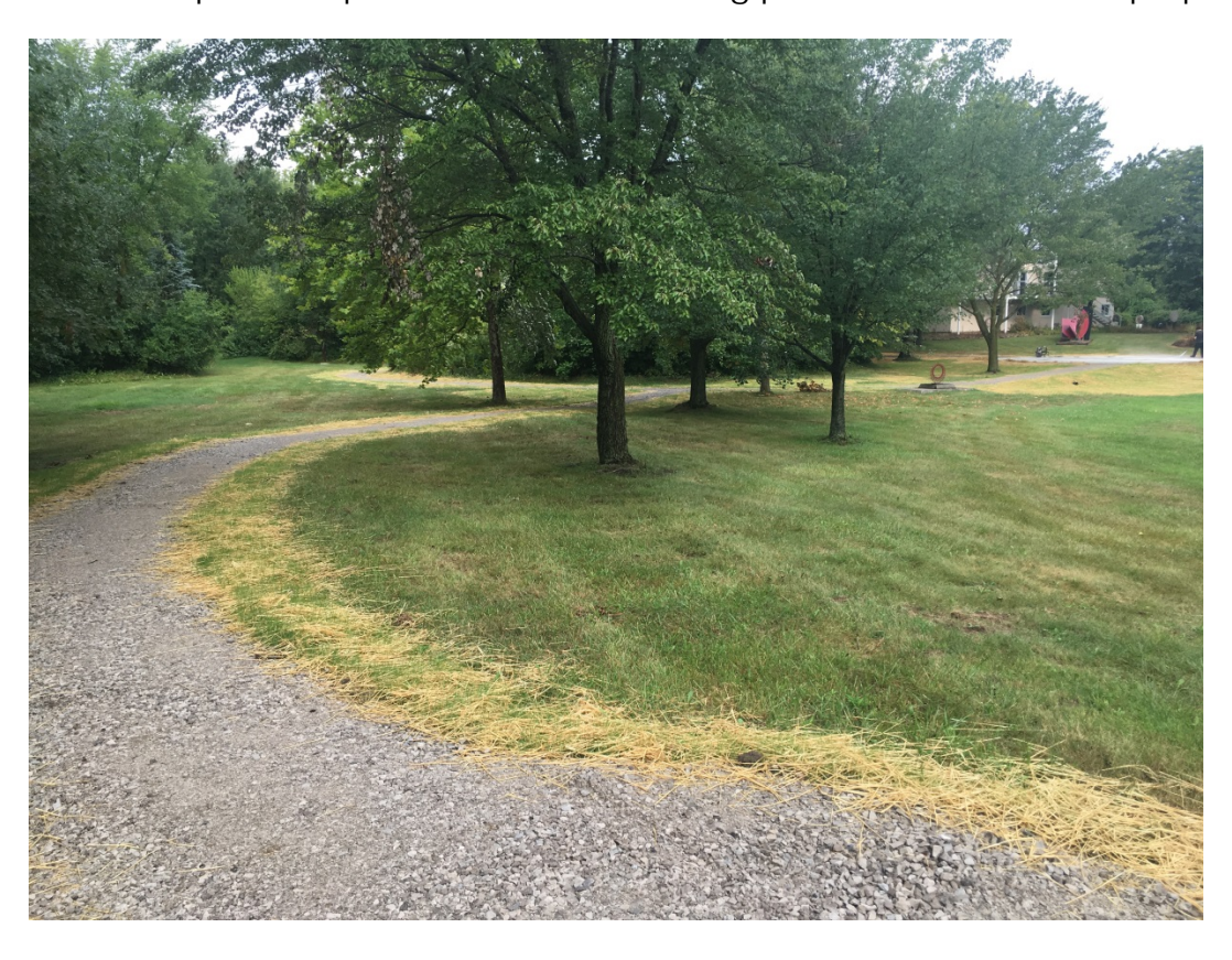
Newly installed five-foot wide gravel pathway around the property.