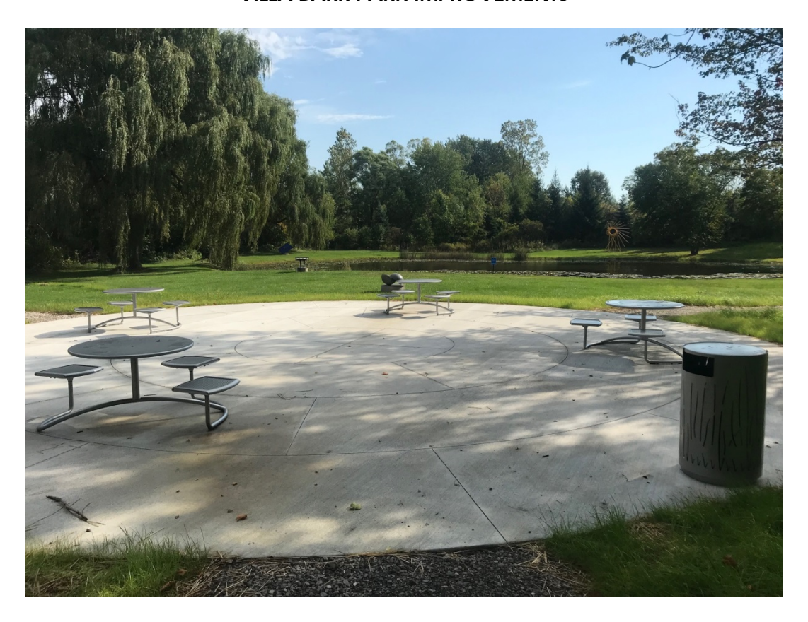
New concrete pad with park benches overlooking pond at the rear of the property.