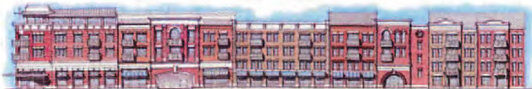
Conceptual Municipal Drive Elevation

The proposal for the first major mixed-used development project in downtown Fishers will go before Town Council on February 12 to seek approval. The Project, developed by Flaherty & Collins Properties , would be located on the northwest corner of 116th Street and Municipal Drive. The property will occupy 3.4 acres and will include 241 luxury apartments, 16,500 square feet of restaurant and retail space, a 4-story parking garage with over 400 parking spaces, and 7,000 square feet of residential amenities. If approved, the project will break ground mid 2013.