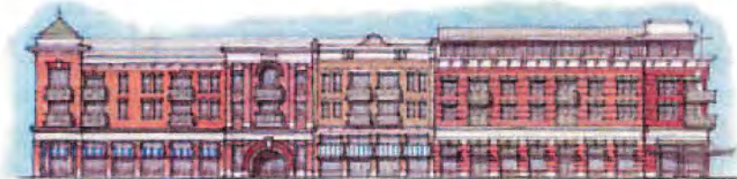
Conceptual 116th Street Elevation