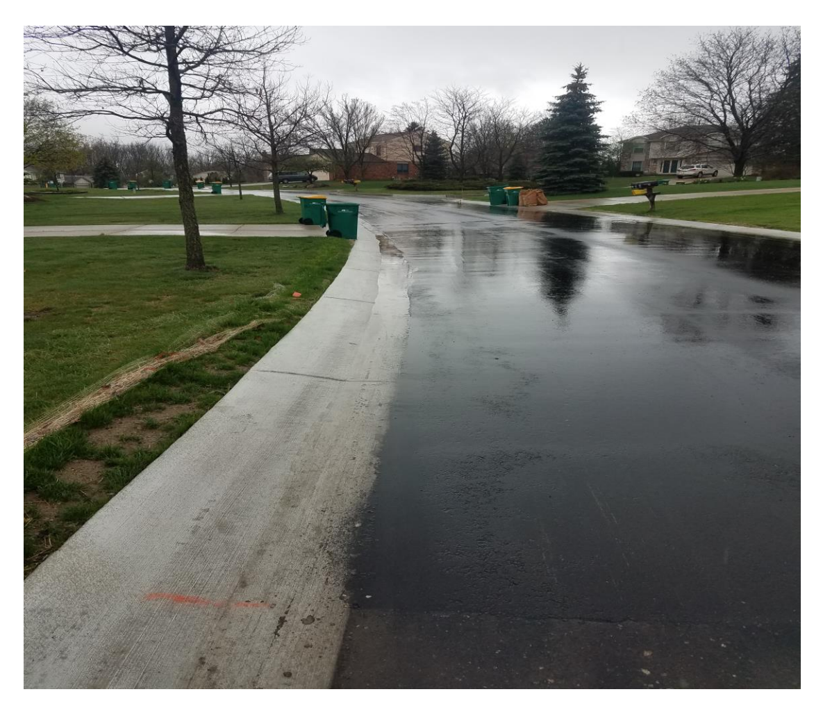
Greening Drive – North of Greening Court