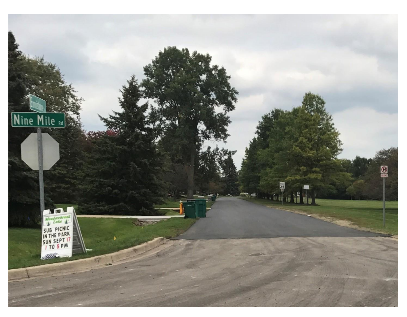
Ennishore Drive – Looking north from 9 Mile Road