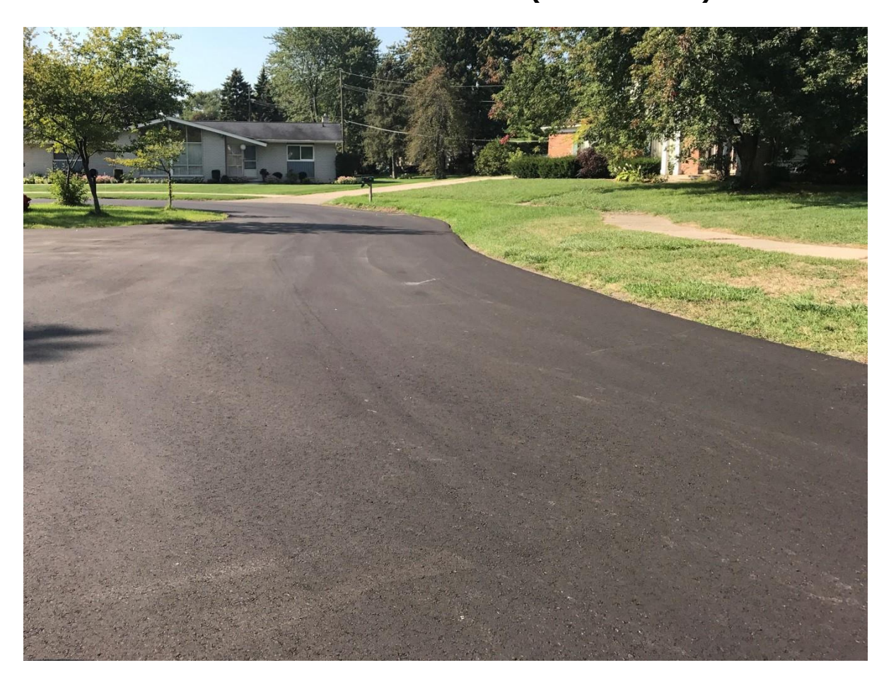
Buckingham Court - Looking south from 10 Mile Road