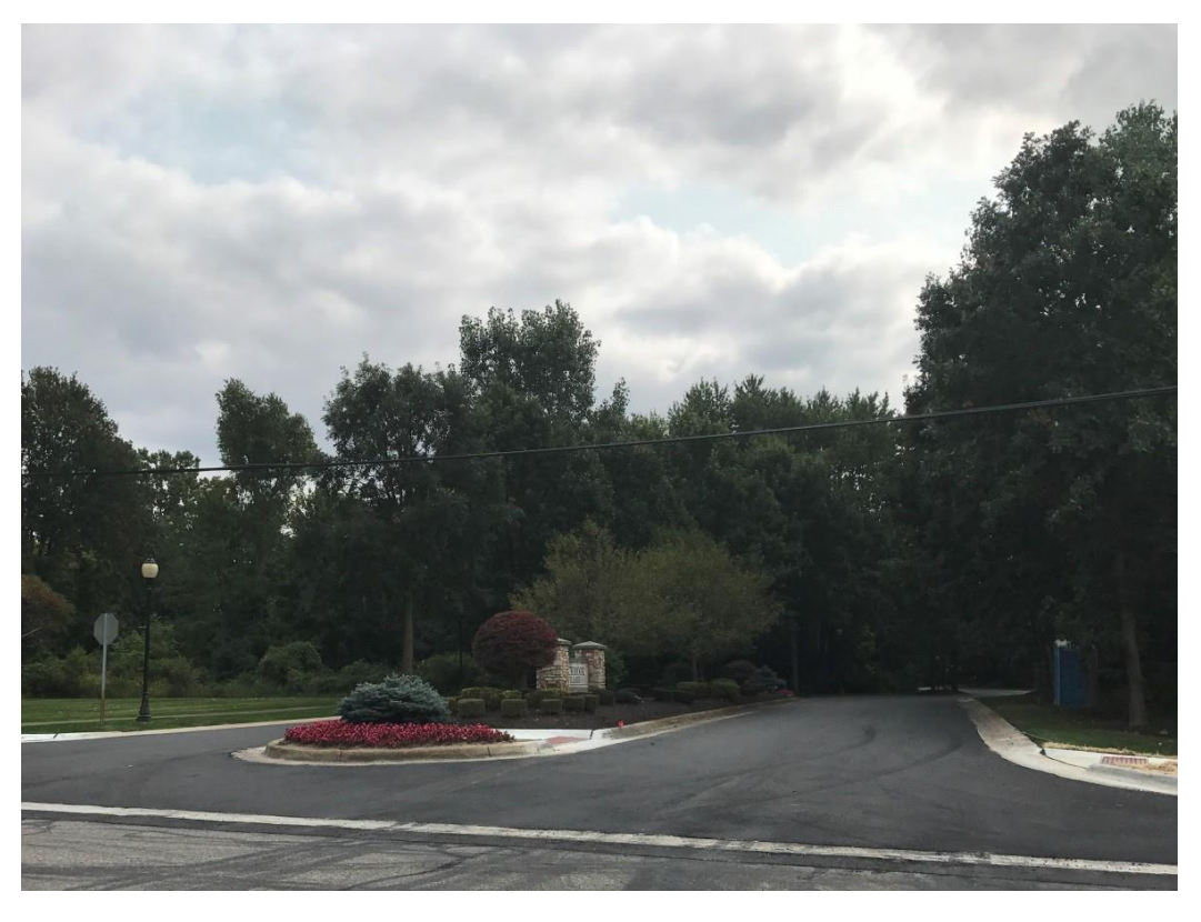
Lochmoor Drive – Looking south from 11 Mile Road