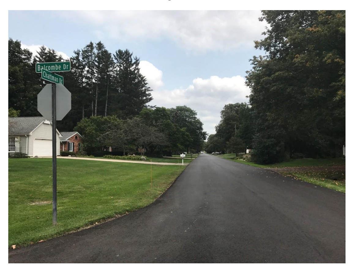
Chattman Street – Looking east from Balcombe Drive