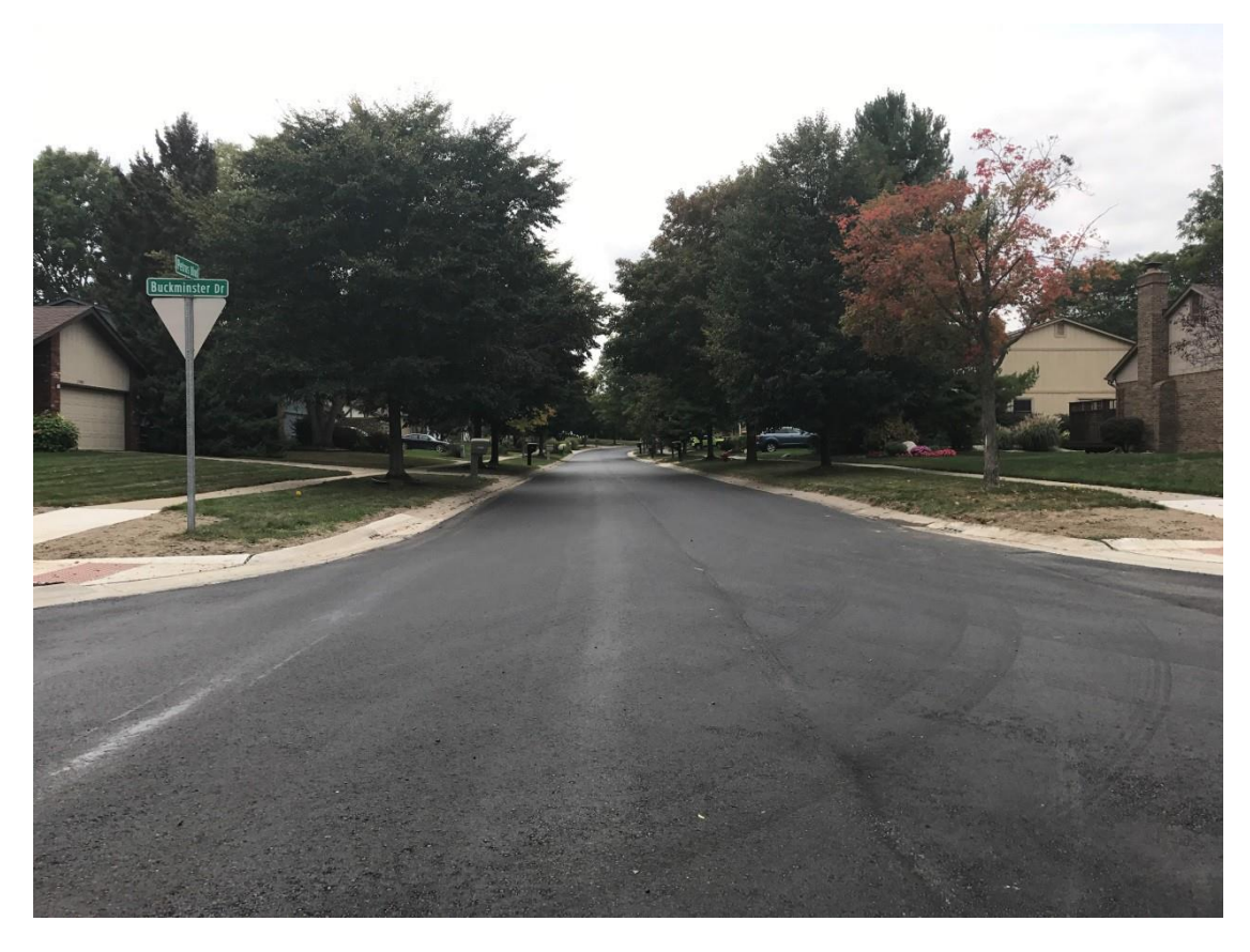
Petros Boulevard – Looking west from Buckminster Drive