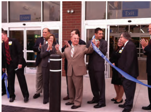
Rebirth of the Novi Town Center included the opening of several new retail stores and restaurants including Wal-Mart this past summer