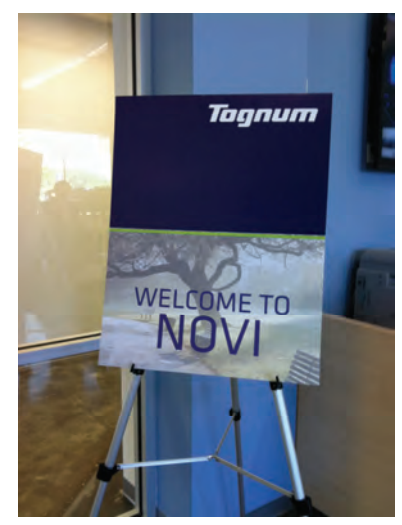
Tognum America opens its new corporate offices with a tour to city officials (Aug., 2012)