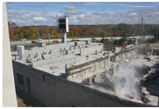
Hyatt Place construction in progress for a Spring/ Summer, 2013 open. (Oct., 2012)