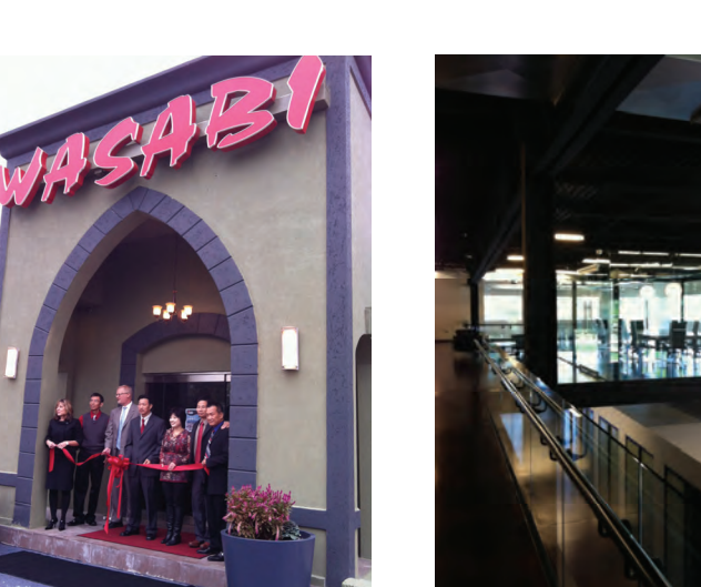
Wasabi Steakhouse, one of several new restaurants that opened in 2012 (Feb., 2012)