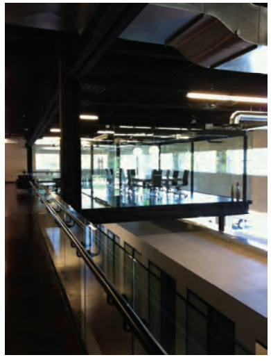
Macprofessionals unveils their new state-of-the art 45,000 sq. foot headquarters (Jan., 2012)