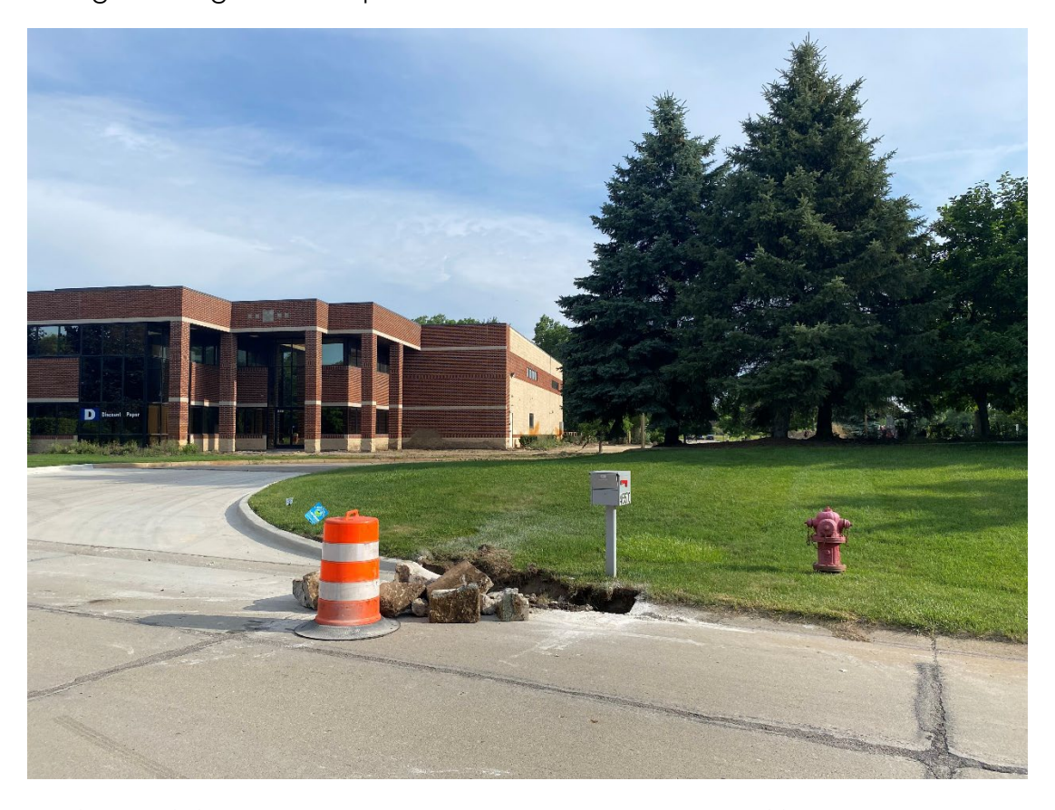
During – Existing concrete pavement removals and condition on Peary Court