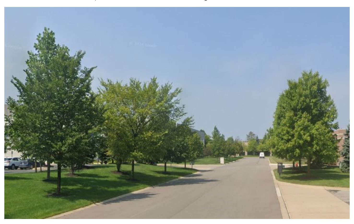
After – Completion of Peary Court in the Beck North Corporate Park