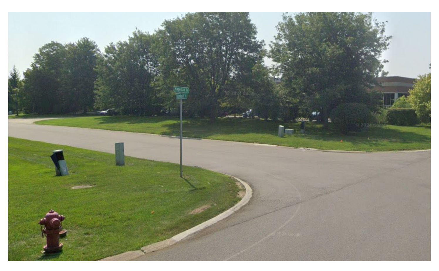
After – Completion of the intersection of Magellan and Humboldt Drives.