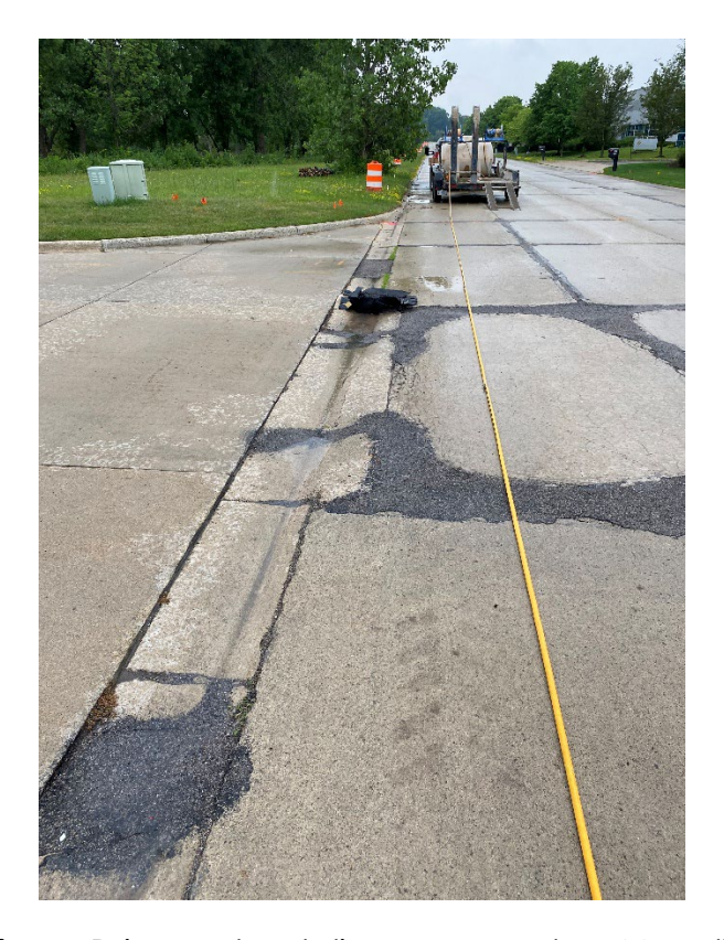
Before – Drive and curb line pavement on Magellan