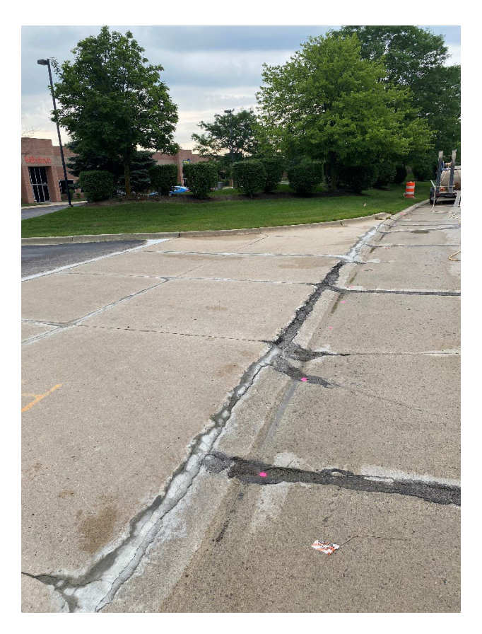
Before – Drive and curb line pavement on Humboldt