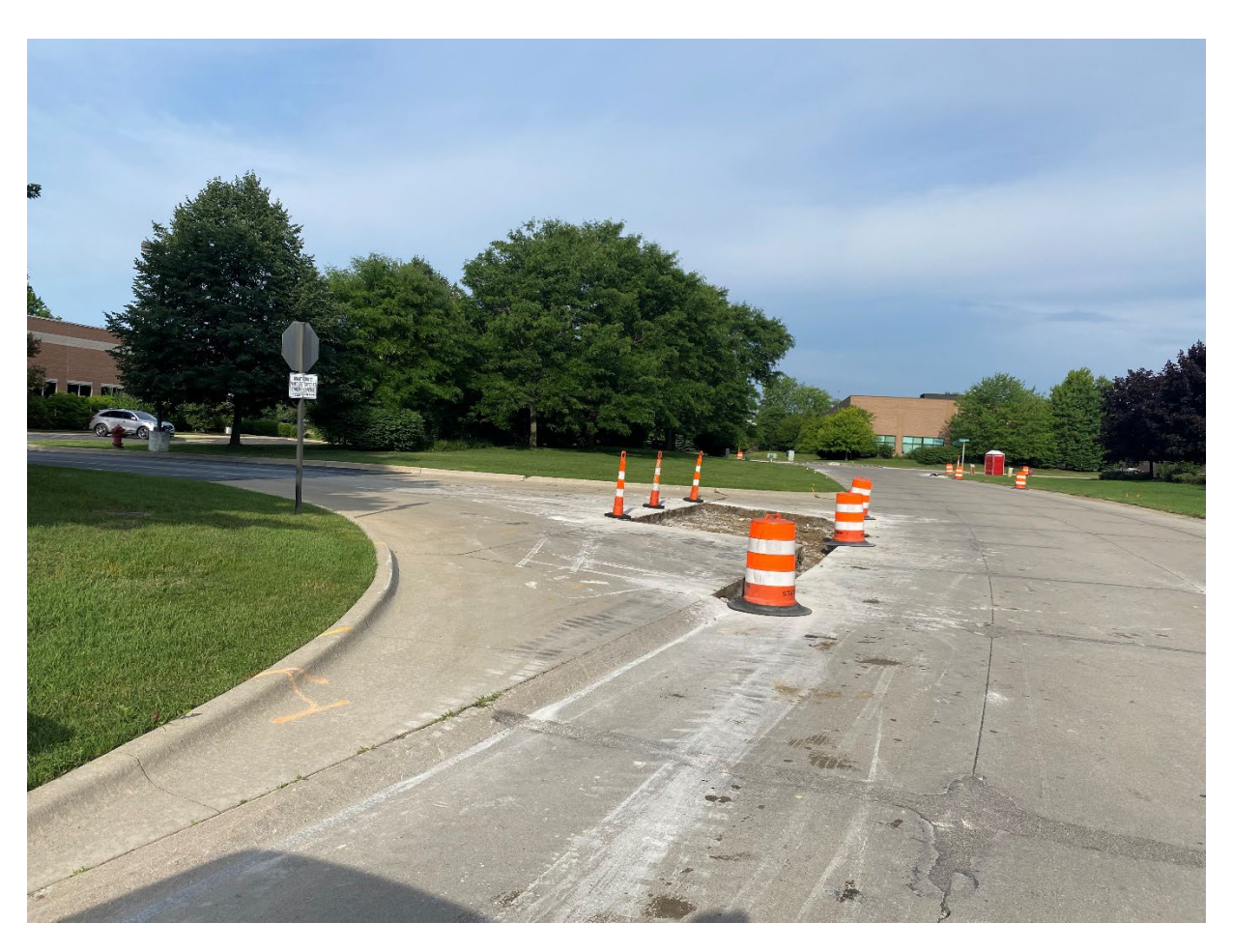
During – Existing concrete pavement removals and condition on Hudson Drive