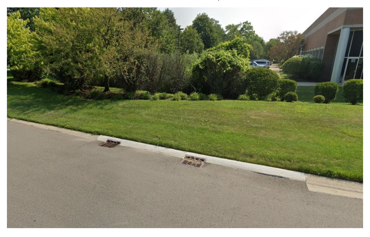
After – Drive and curb pavement completed on Magellan Drive