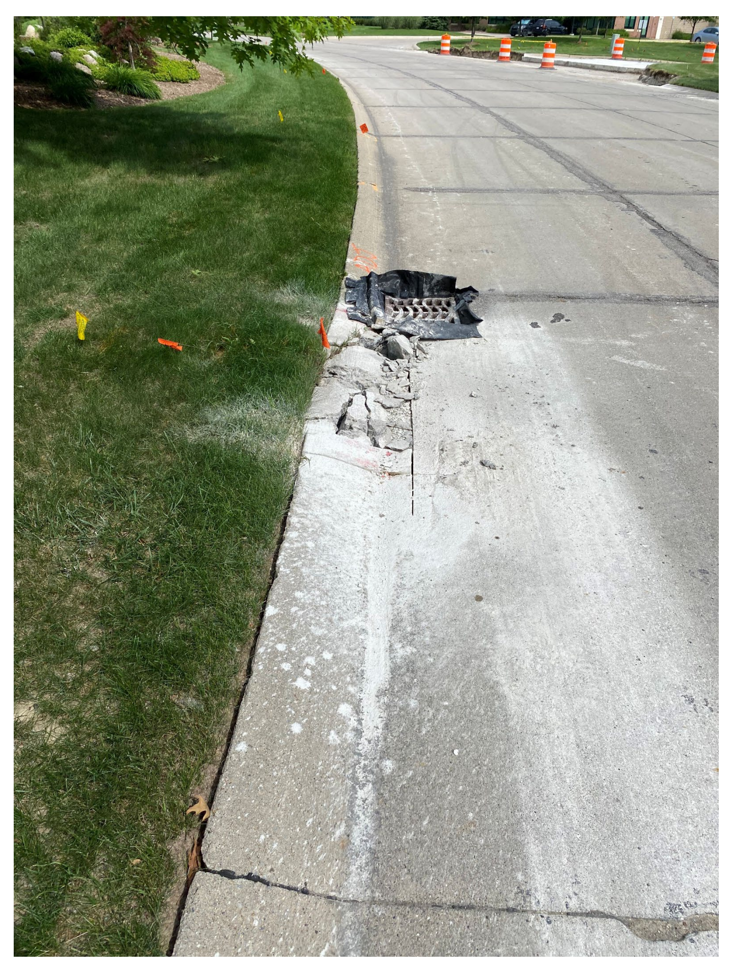
During – Saw cutting and preparation work on existing concrete in the Beck West Corporate Park