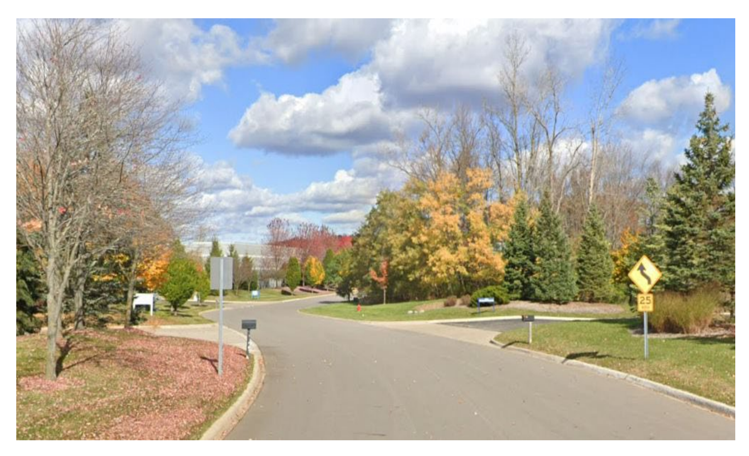
After – Hudson Drive completed