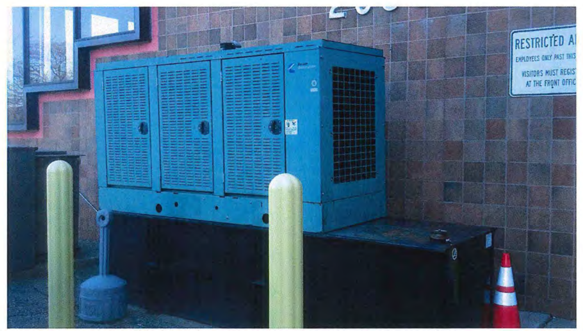
Field Services Complex Emergency Generator