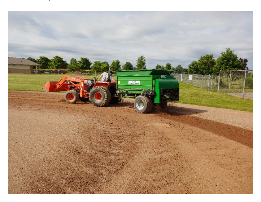
Demo Dakota Top Dresser