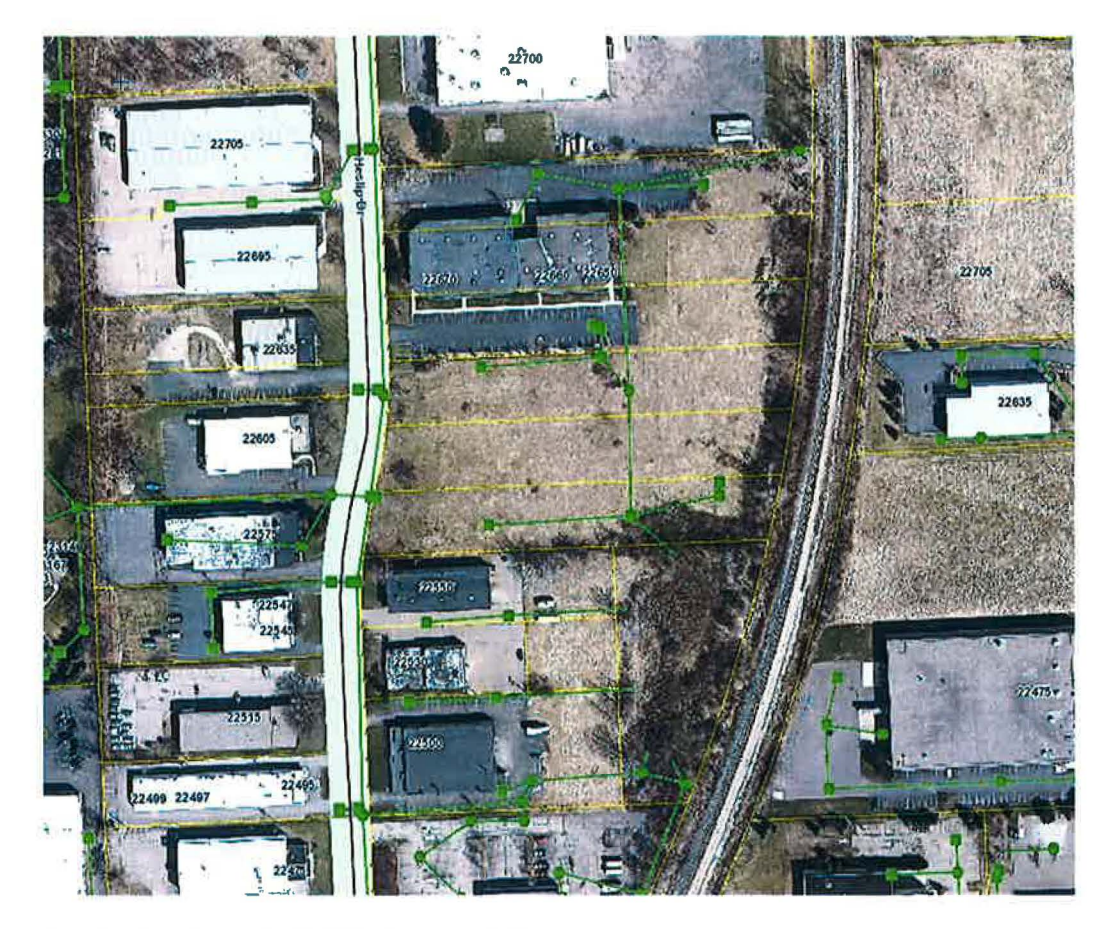
Heslip Basin – Aerial Photograph (Pre-Construction) – Heavy Overgrowth