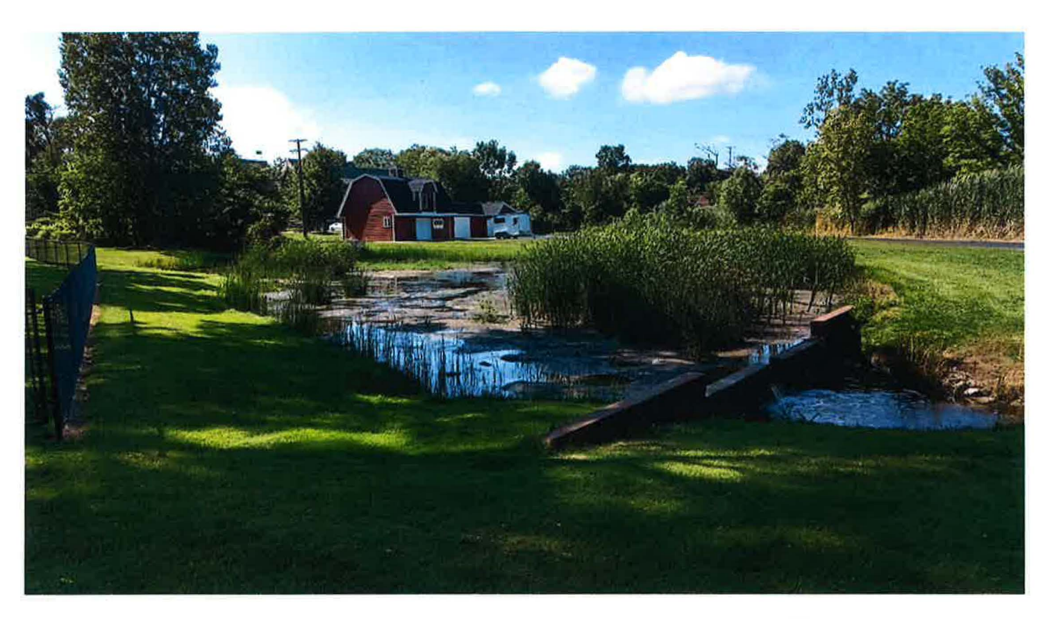
Bassett Drain (McSweeney Pond) – Pre-Construction Condition