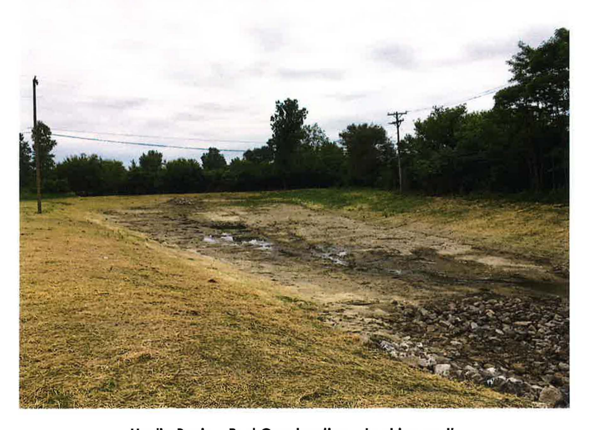
Heslip Basin – Post Construction – Looking north