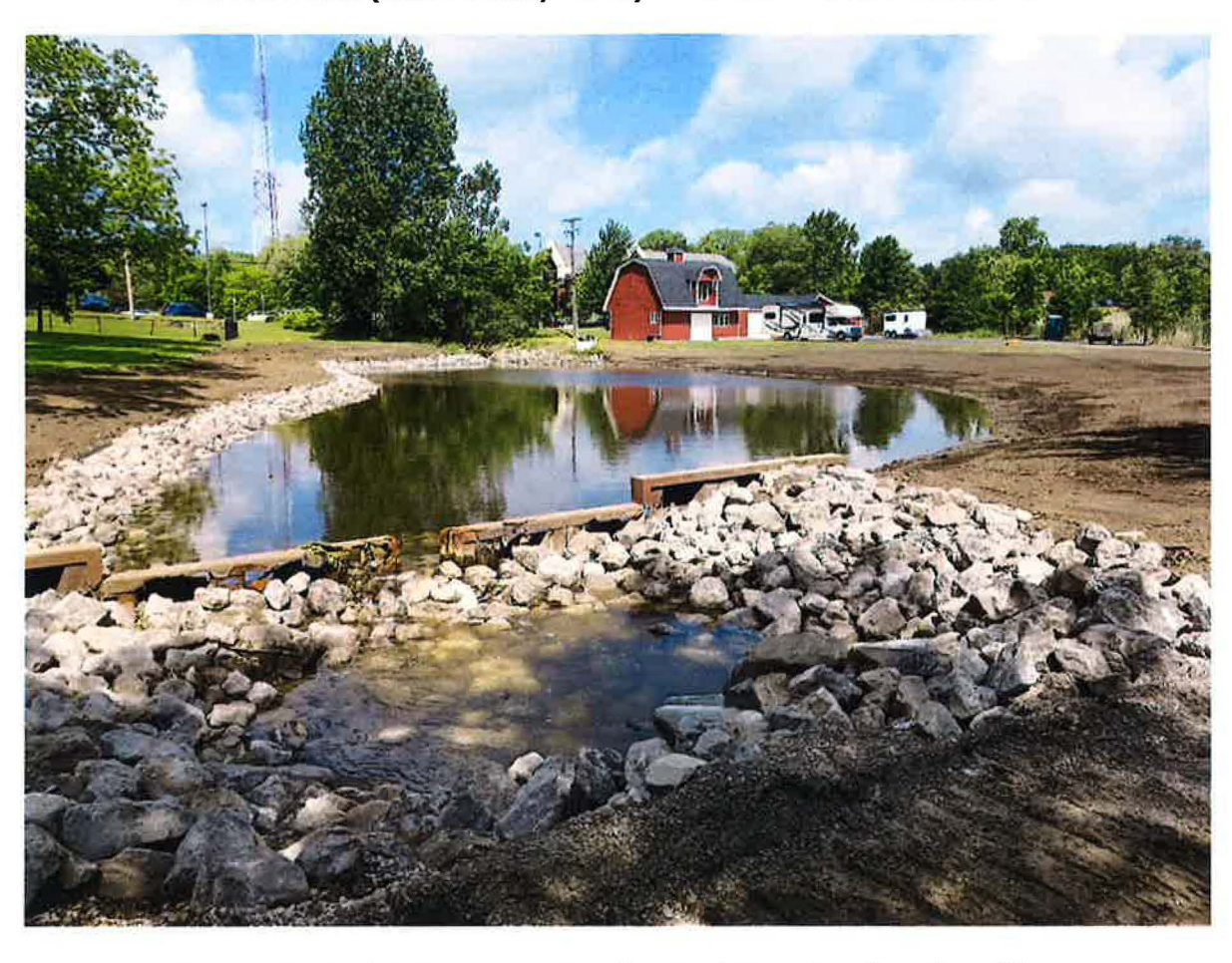
Bassett Drain (McSweeney Pond) – Post-Construction Condition