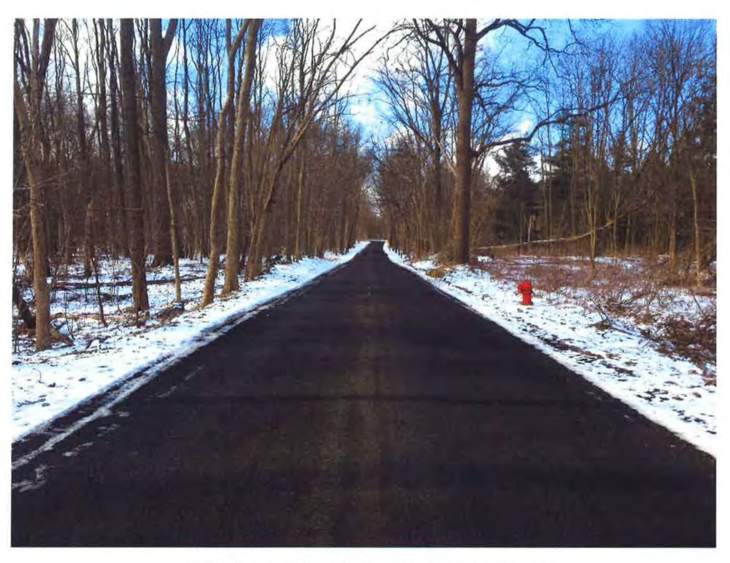
12 ½ Mile Road – Looking west towards Dixon Road