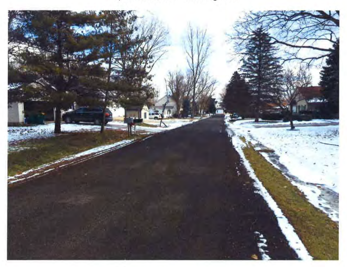
North Haven Drive – Looking east towards Walled Lake