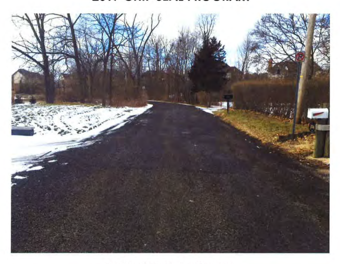
Faywood Street – Looking west