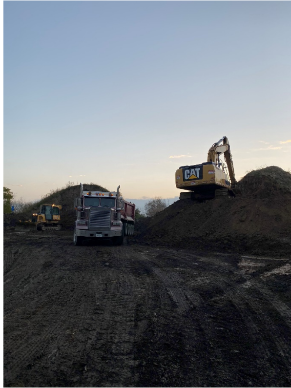
Loading up material from the DPW Site