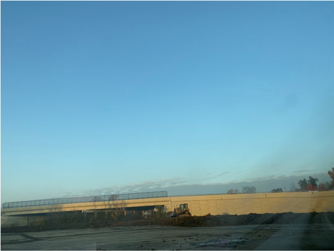
Grading and leveling-out of the material at the west end of the Water Tower Park property