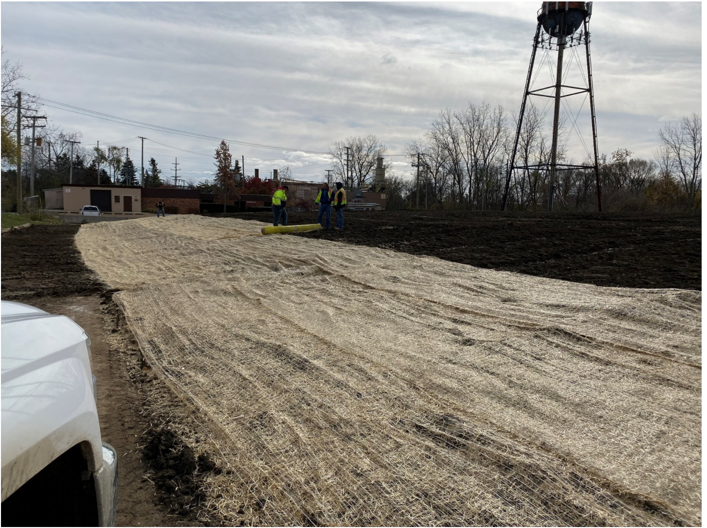
Filling at the Water Tower Park property now complete. Placing erosion control blankets to stabilize