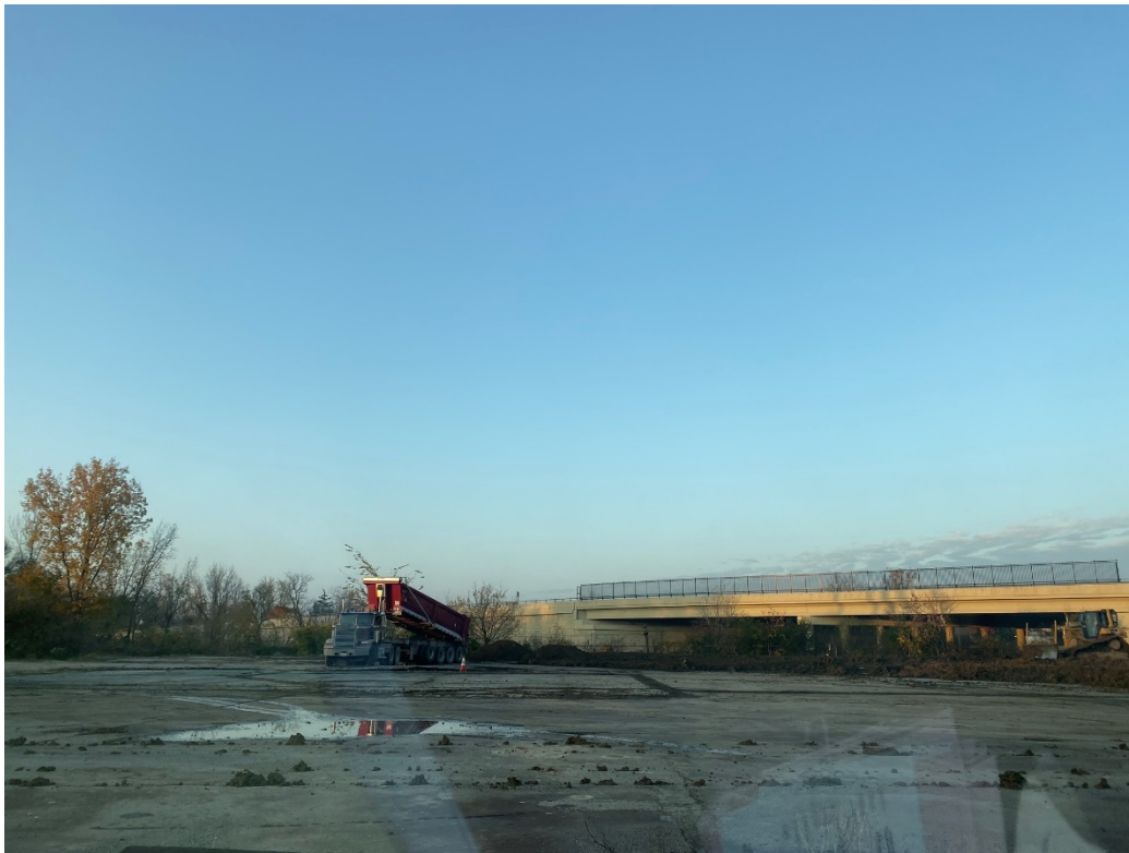
Unloading material at the Water Tower Park location of Novi Road and Trans-X