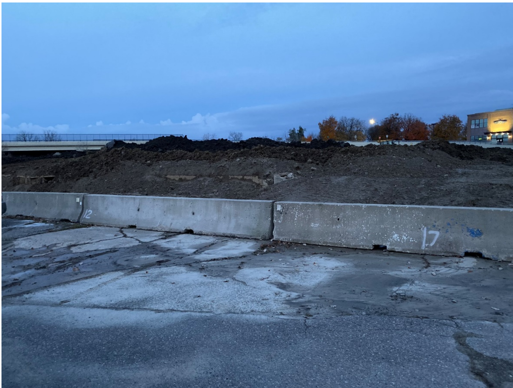
Approximately 8-feet of fill placed at the east end of the Water Tower Park property