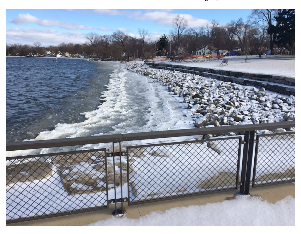
Pavilion Shore Park - Winter-time shoreline east of concrete look-out.