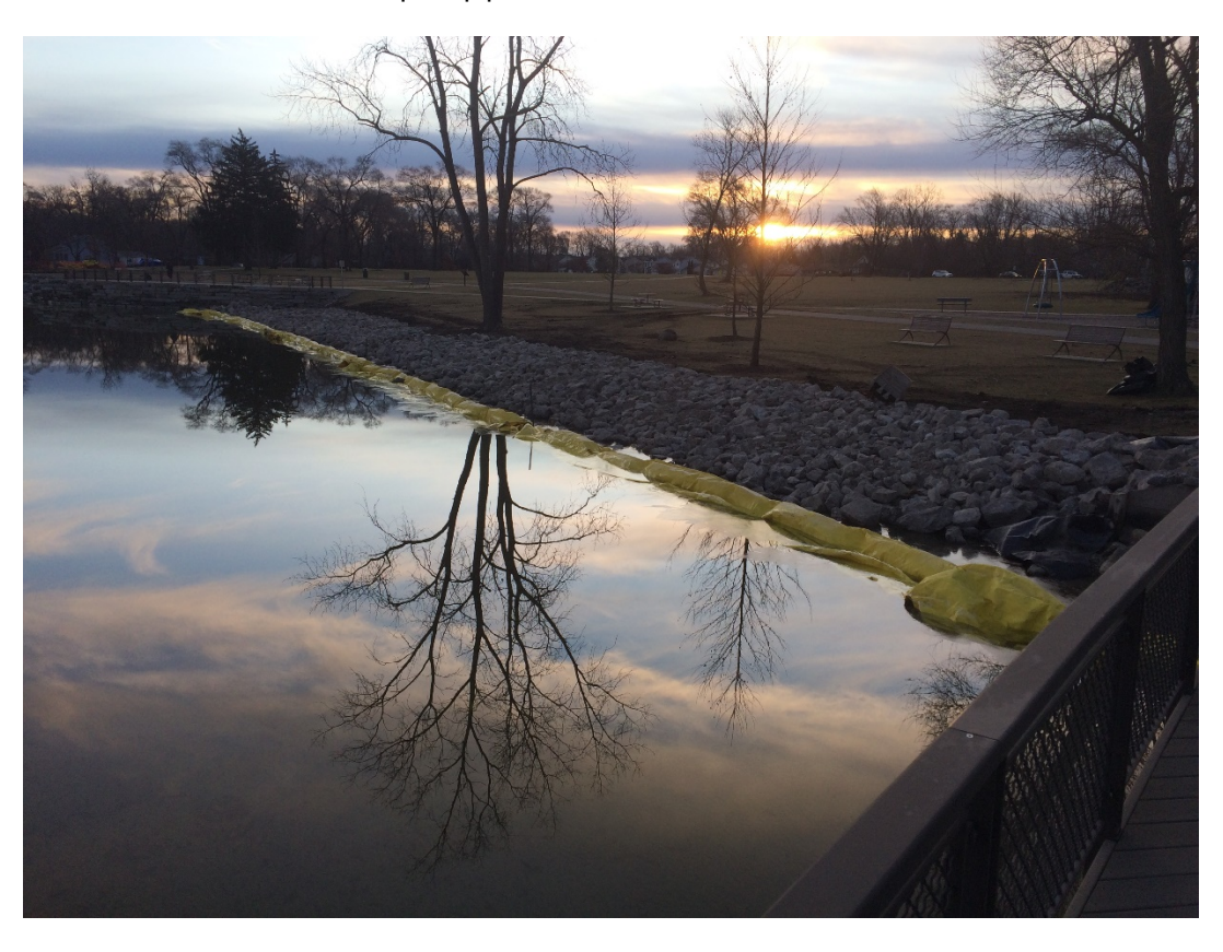
Pavilion Shore Park - Rip-rap lined shoreline along the western half