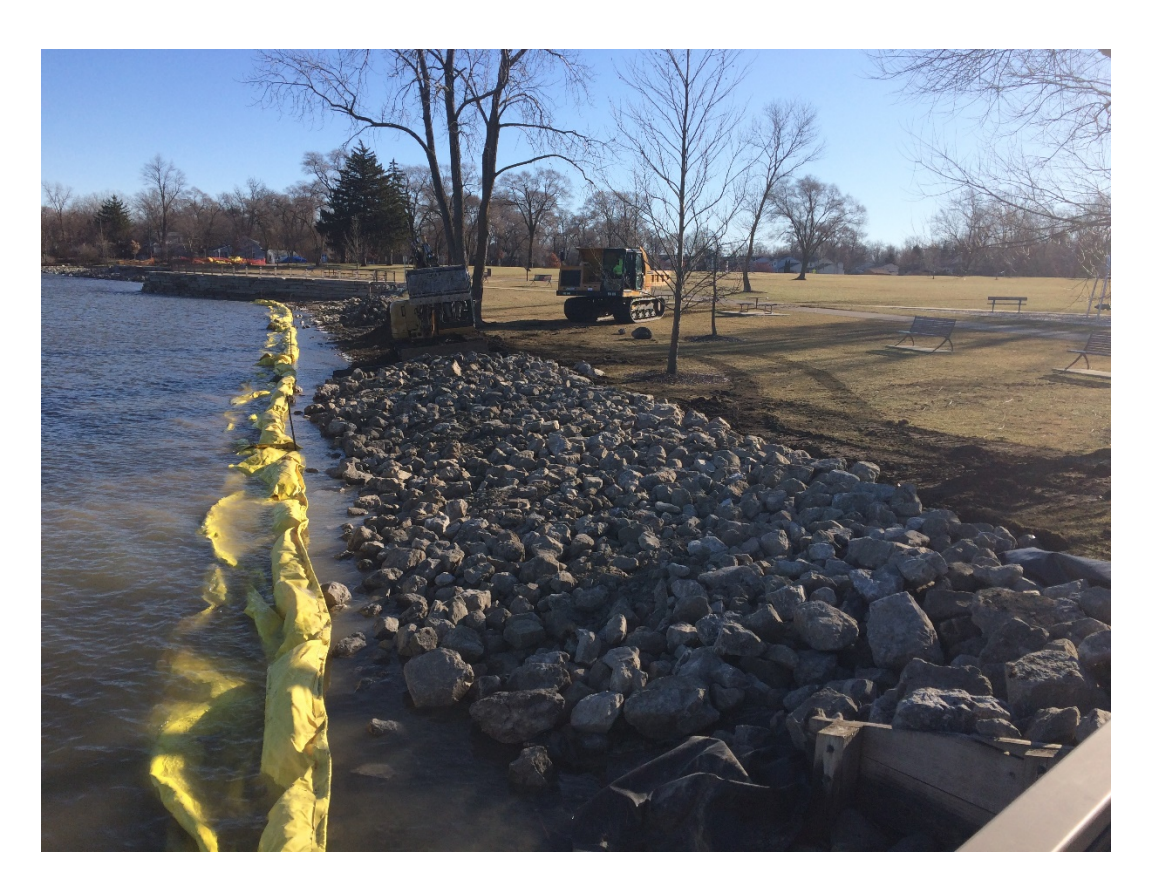
Pavilion Shore Park - Western rip-rapped shoreline near the wooden boardwalk look-out.