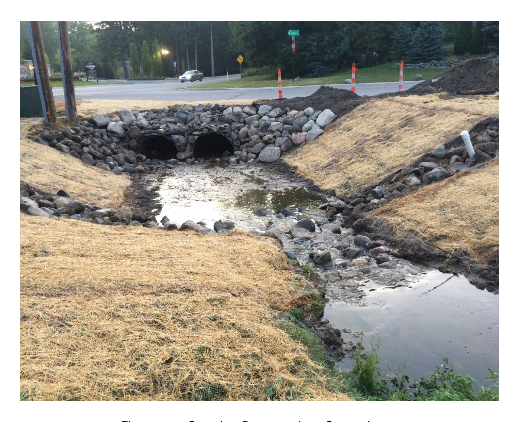
Thornton Creek – Restoration Complete.