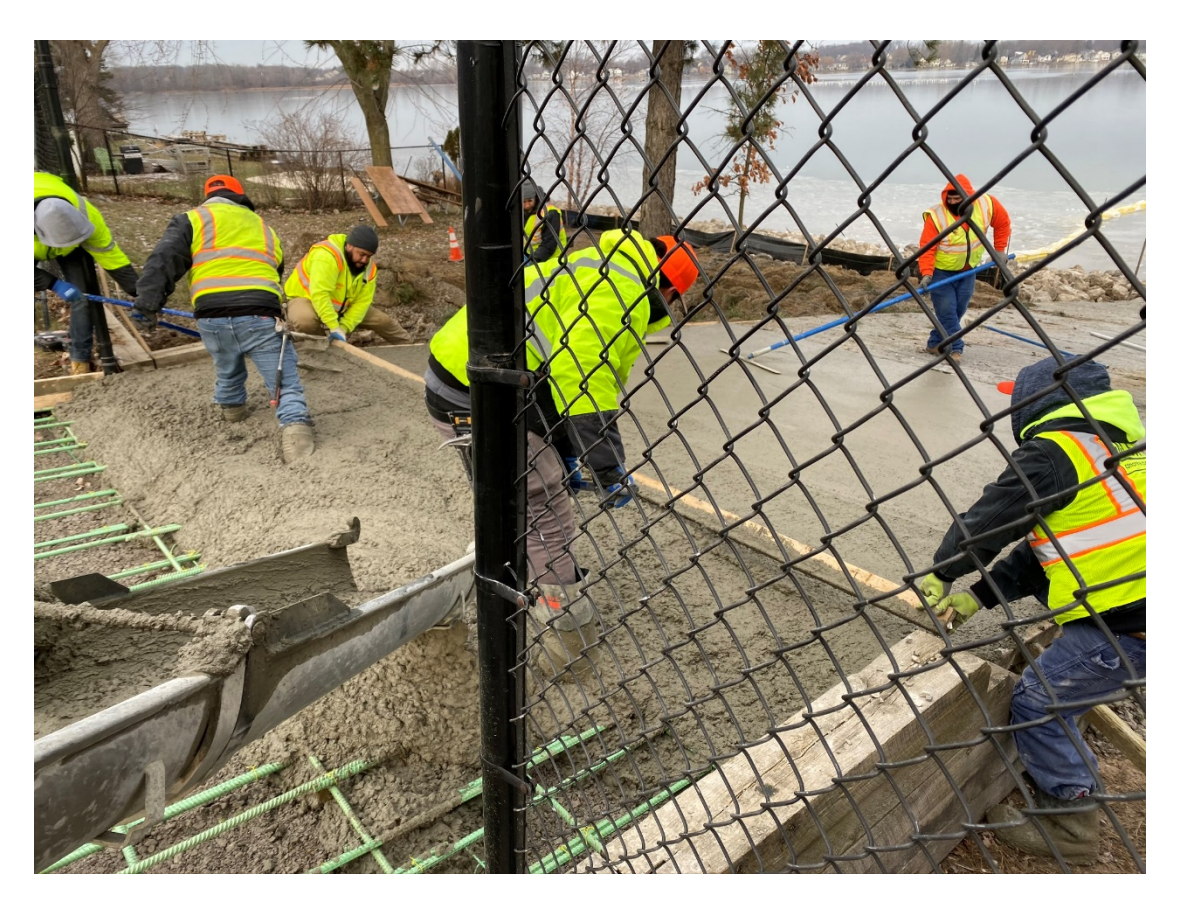
Lakeshore Park – concrete pour of the new boat launch.