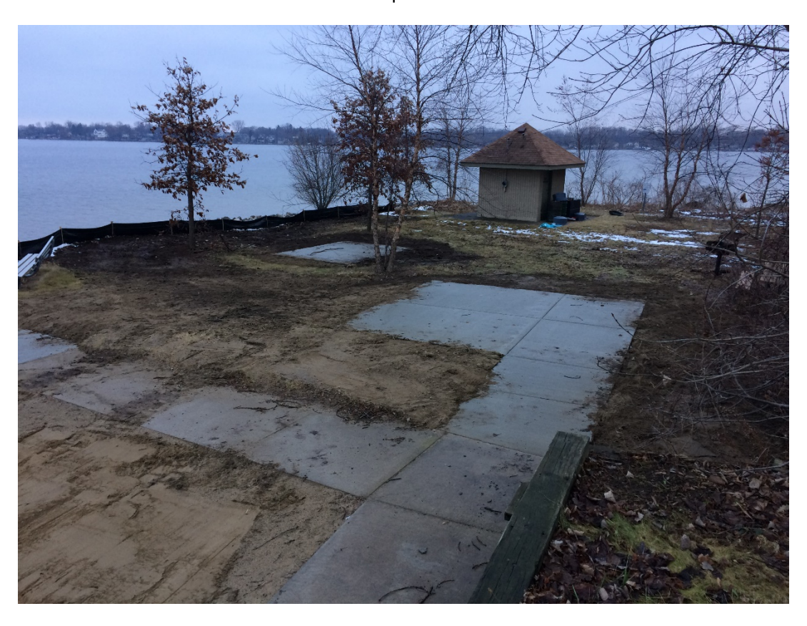
Lakeshore Park - Eastern sidewalk, lake ramp and picnic table bases