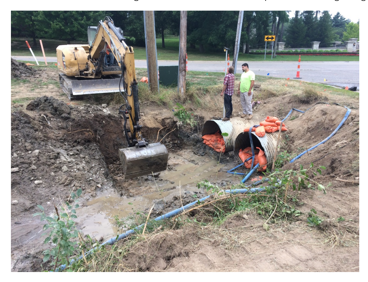
Thornton Creek culvert crossing at 9 Mile and Center Street - clearing and grading.