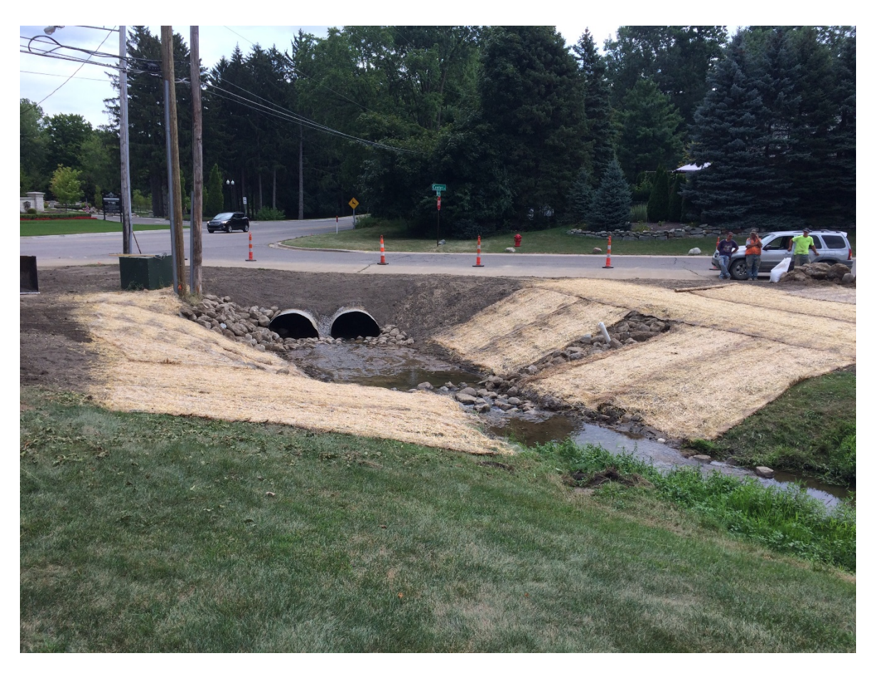
Thornton Creek culvert crossing at 9 Mile and Center Street – start of restoration.