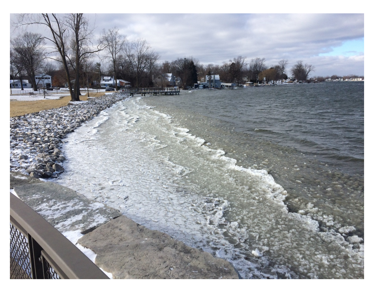
Pavilion Shore Park – The winter after installation holding up well to the ice-floe.