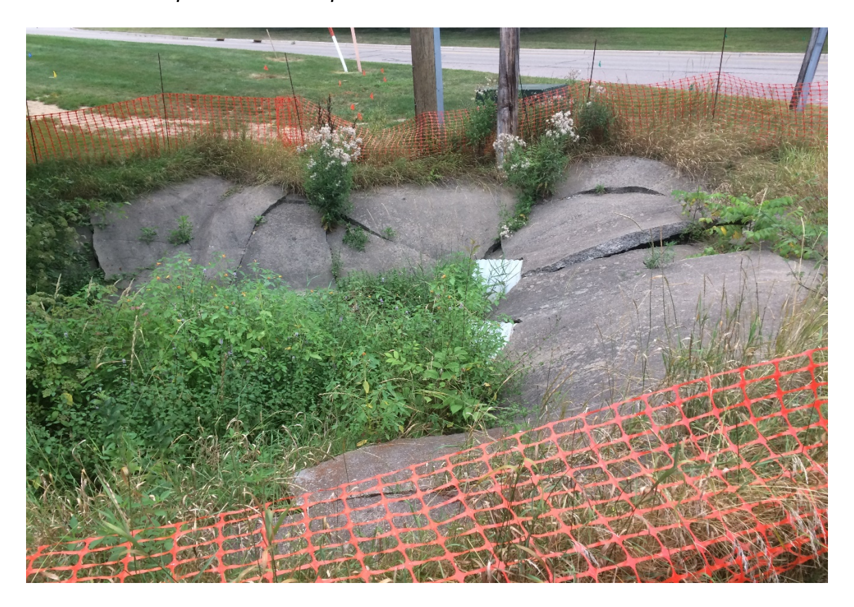
Thornton Creek culvert crossing at 9 Mile and Center Street prior to work beginning.