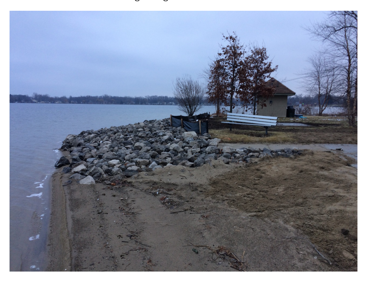
Lakeshore Park - Eastern rip-rap anchored shoreline stabilization