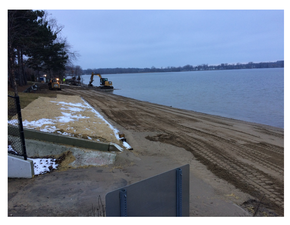
Lakeshore Park - Revised grading near the tunnel and beach stabilization