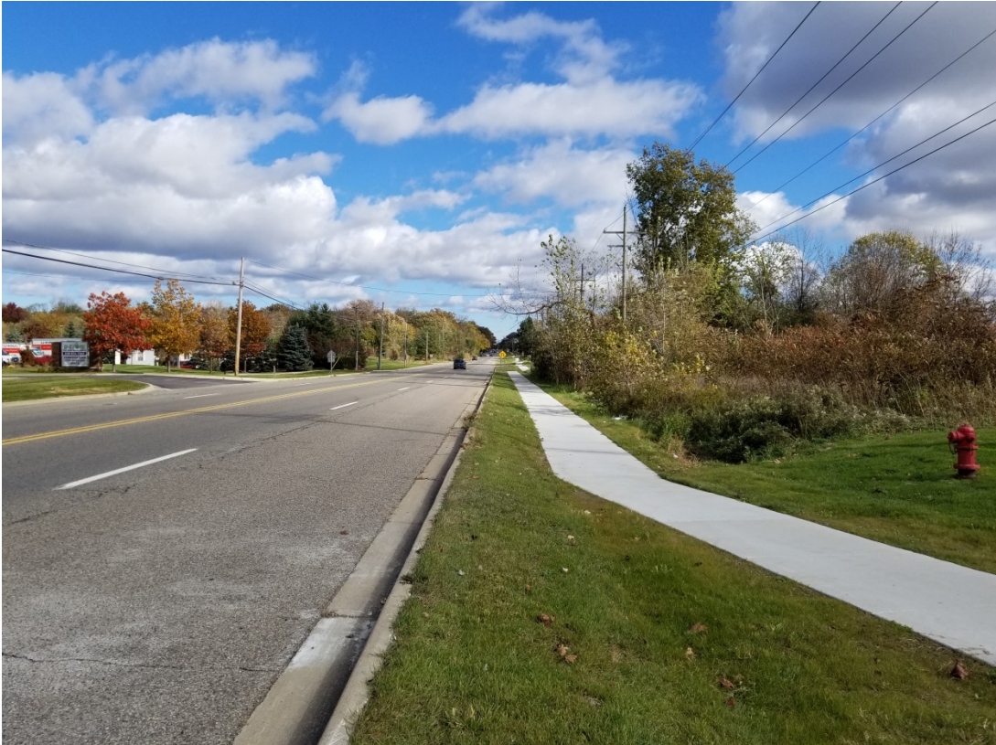
At the Portsmouth Place Apartments frontage looking east.