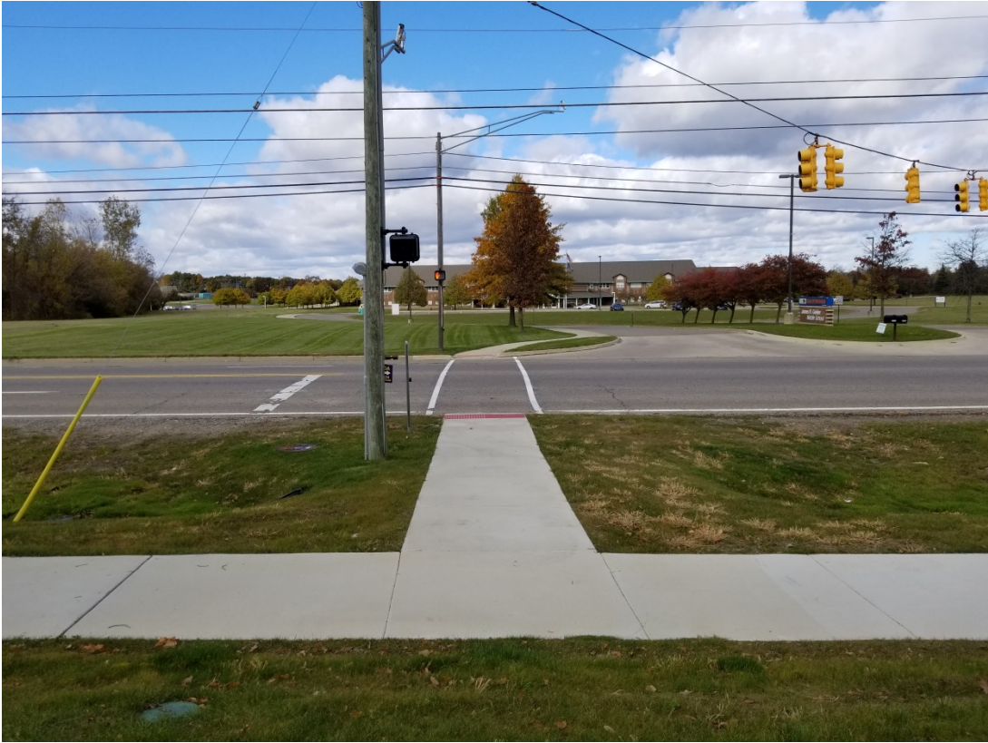
Giesler Middle School crossing of Pontiac Trail.