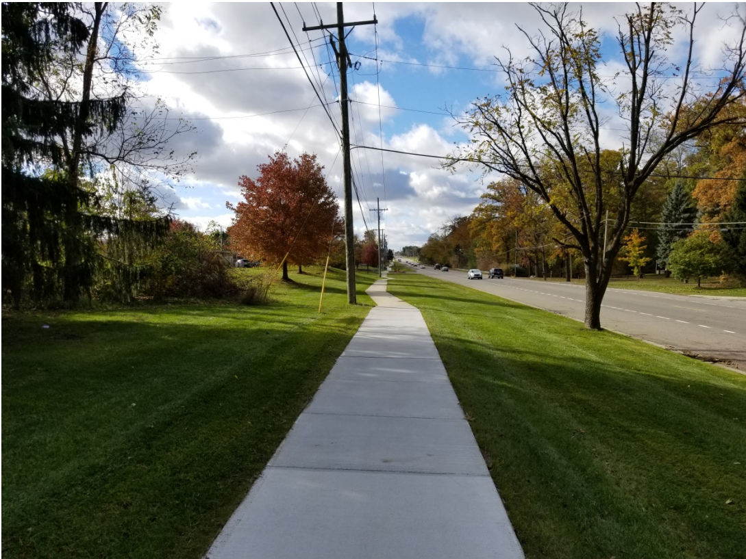
At the Springs Apartments complex frontage looking west.