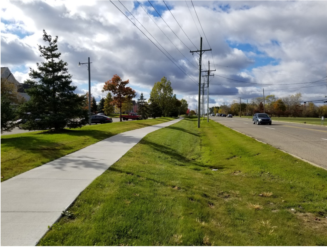
At the Portsmouth Place Apartments frontage looking west.