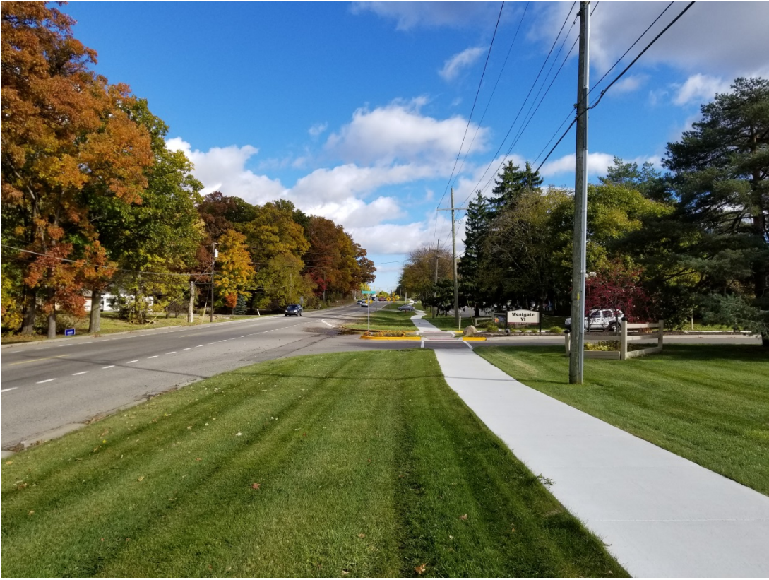
At the Westgate IV Apartments looking east along the shopping plaza.