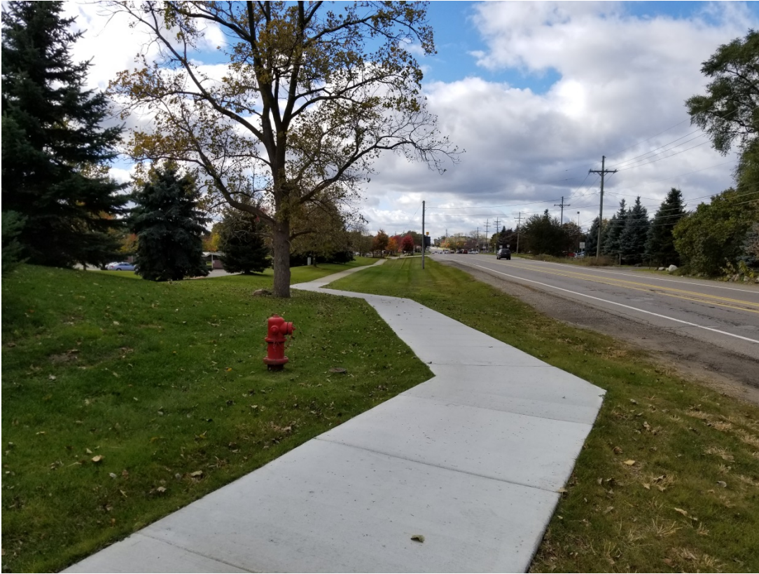
West end tie-in to existing sidewalk at Portsmouth Apts. and Kroger.