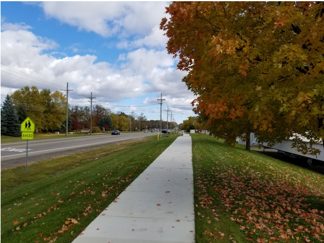
West end of project looking east along Portsmouth Apartments property.