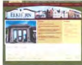
City of Elkhorn, WI www.cityofelkhorn.org Client since 2005 Pop. 10,118