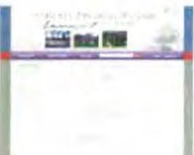
Village of Franklin, MI www.franklin.mi.us Client since 2012 Pop. 3,171