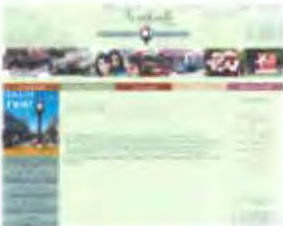
City of Northville, MI www.cityofnorthville.org Client since 2001 Pop. 5,970