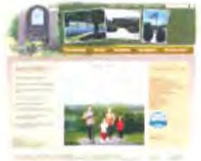
Village of Hanover Park, IL www.hpil.org Client since 2000 Pop. 37,973