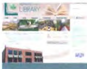
Adrian Library, MI www.adrian.lib.mi.us Client since 2011