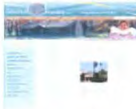
Chesterfield Township, MI www.chesterfieldtwp.org Client since 2009 Pop. 43,381