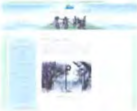
Cascade Township, MI www.cascadetwp.org Client since 2003 Pop. 15,100

muniweb™ has developed websites for over 100 municipal organizations. The websites below demonstrate some of our more recent and/or innovative websites.