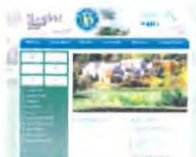
Bloomfield Township, MI www.bloomfieldtwp.org Client since 2003 Pop. 41,070