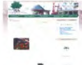
City of Farmington, MI www.ci.farmington.mi.us Client since 2010 Pop. 10,438