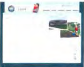
Village of Streamwood, IL www.streamwood.org Client since 2000 Pop. 39,858