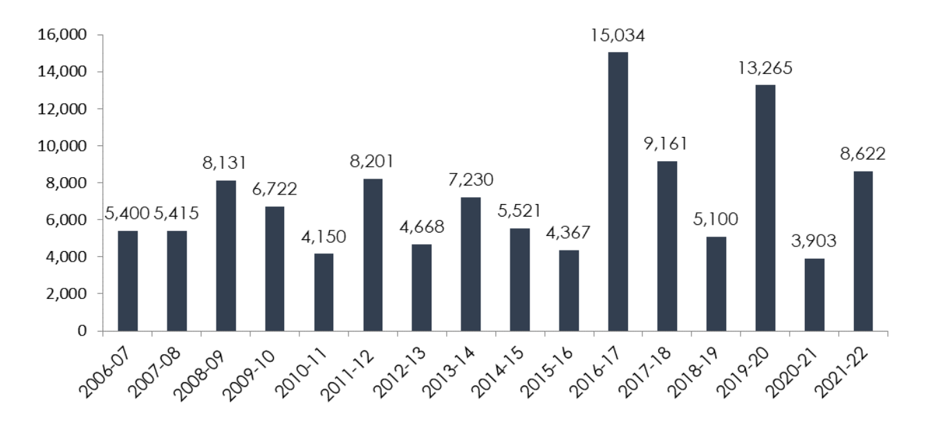
Figure 2.1: 2006 - August 1, 2022 Completed Non-Motorized Improvements by City of Novi in feet (Segments completed by the City of Novi or other public funding only, not including private funding)

** Refer to Table 2.3 in Attachment A for the list of Completed Non-Motorized Improvements by City of Novi by fiscal year