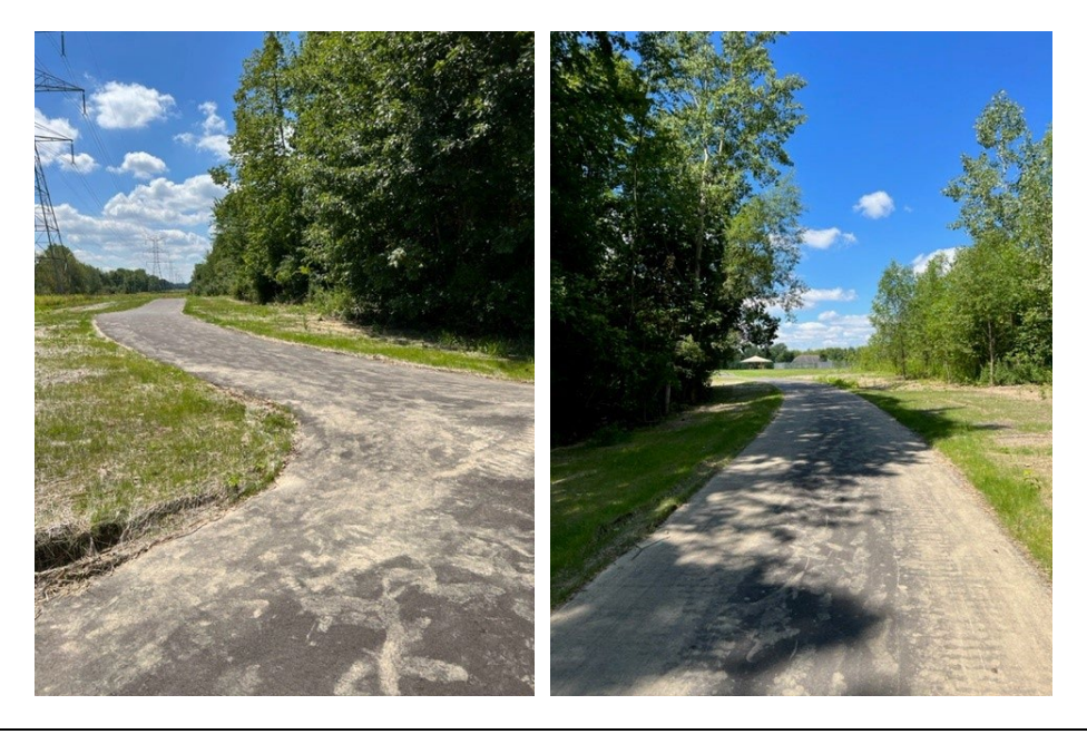
A TAP Grant and cooperative funding with Ascension Providence Hospital was used to complete a connection between Wildlife Woods Park and the ITC Trail, with a spur trail that also connects to the planned trail network on the Ascension campus

This year, the Non-Motorized Master Plan is scheduled for a comprehensive update. This will include a full update of the inventory of the non-motorized facilities in the network and a fresh look at the recommendations for future improvements and policies. An analysis of the current prioritization process may also result in recommended changes. The final document is expected to be completed in 2023.