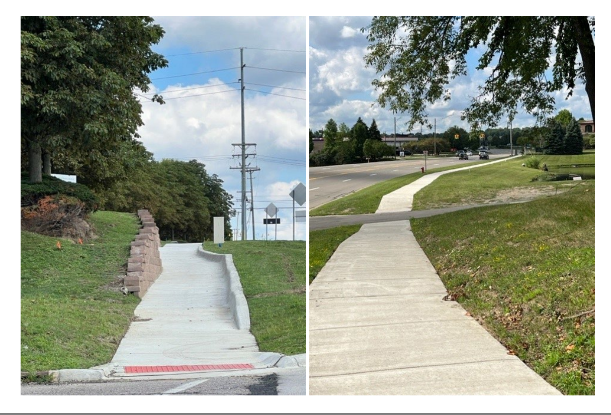
Segments 120a & 120c: On Haggerty Road between Eight Mile and Nine Mile the City completed 3 segments of missing sidewalk