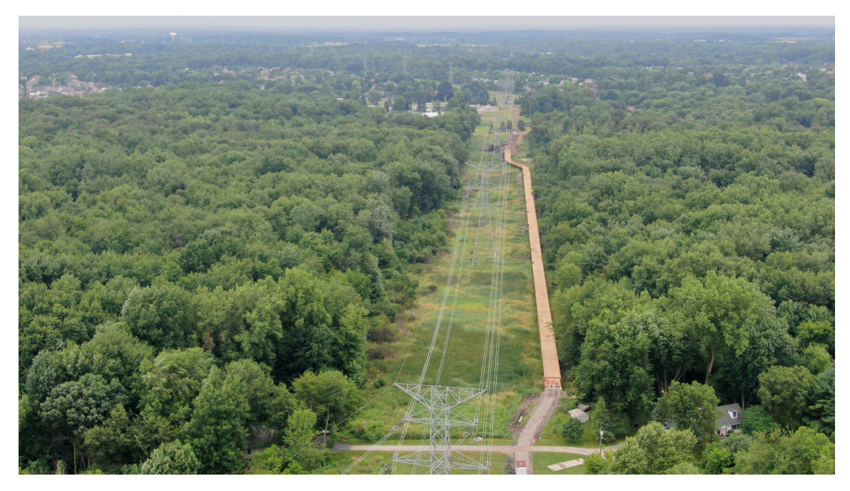
Longest Boardwalk in Novi, approximately 1,975 feet long (nearly 0.4 mile) is part of the ITC Trail

When a boardwalk does not connect to other pedestrian improvements, it leads to under usage of these structures and may result in removal. In some cases, access to certain boardwalks is closed from use to avoid further deterioration. Staff will pay closer attention to segments whose completion would result in the connection to existing boardwalks and avoid expensive removals. City engineering staff is currently working on researching alternate materials such as composites on handrails and balusters, and installation techniques such as using helical piers and adjustable pilings, to minimize the frequency of maintenance and costs of construction. There is a dedicated team in the Field Operations Division of one full-time and one part-time staff member that completes maintenance repairs, with an annual $20K budget for purchasing supplies for repairs.