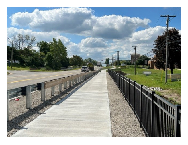
The City completed Segment 70 on Meadowbrook Road between Grand River and 11 Mile Road

Since the inception of this process, public funding (City/State/Federal) has built over 22 miles of non-motorized network. This does not include the sidewalks constructed by private developers. A total of 35 miles are yet to be built along major roads to achieve complete non-motorized connectivity within the City. As of 2022, the City's existing non-motorized network includes about 34 miles of major pathways, 12.5 miles multi-use pathways and 51 miles of sidewalks along major roadways.