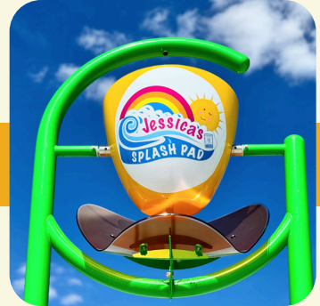
Jessica's Splash Pad