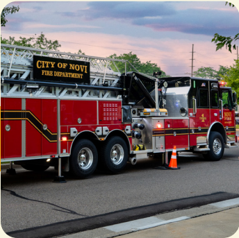
Fire Apparatus Replacements (3 Engines, 1 Ladder Truck)