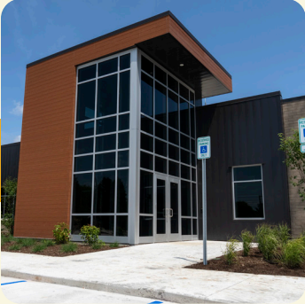
Public Works Expansion & Redesign

These are just a few of the projects completed using the 2016 CIP Millage: