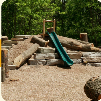
Novi Northwest Park