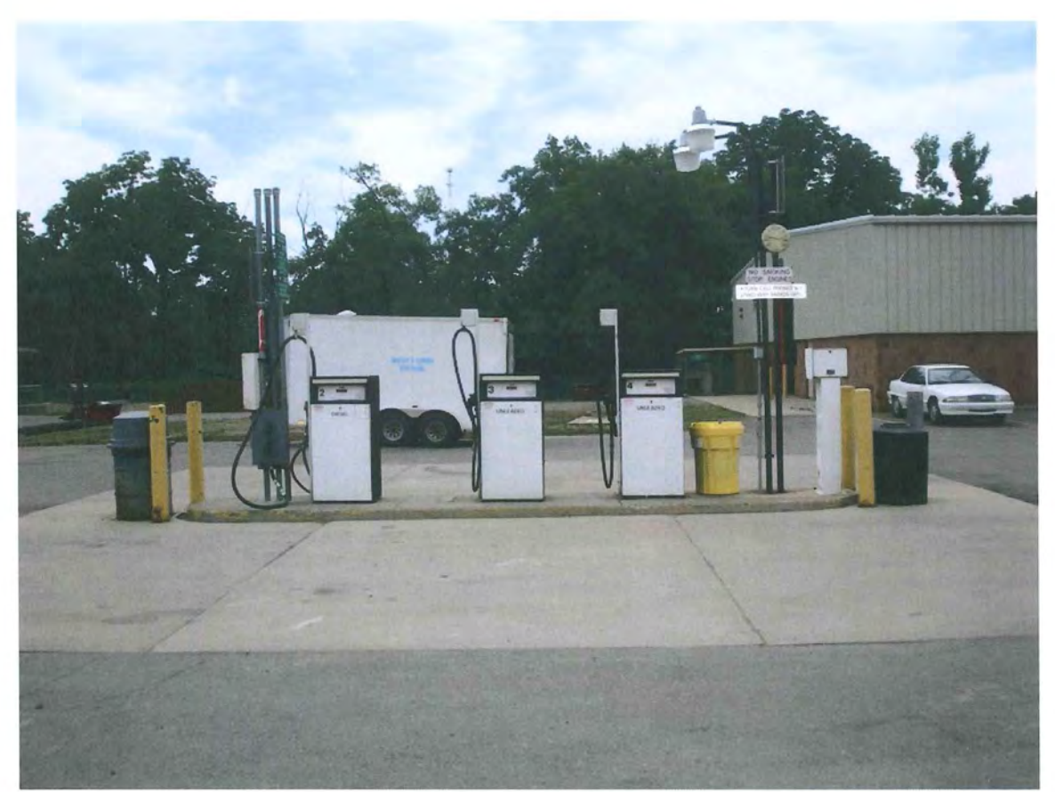
Existing Fuel Island