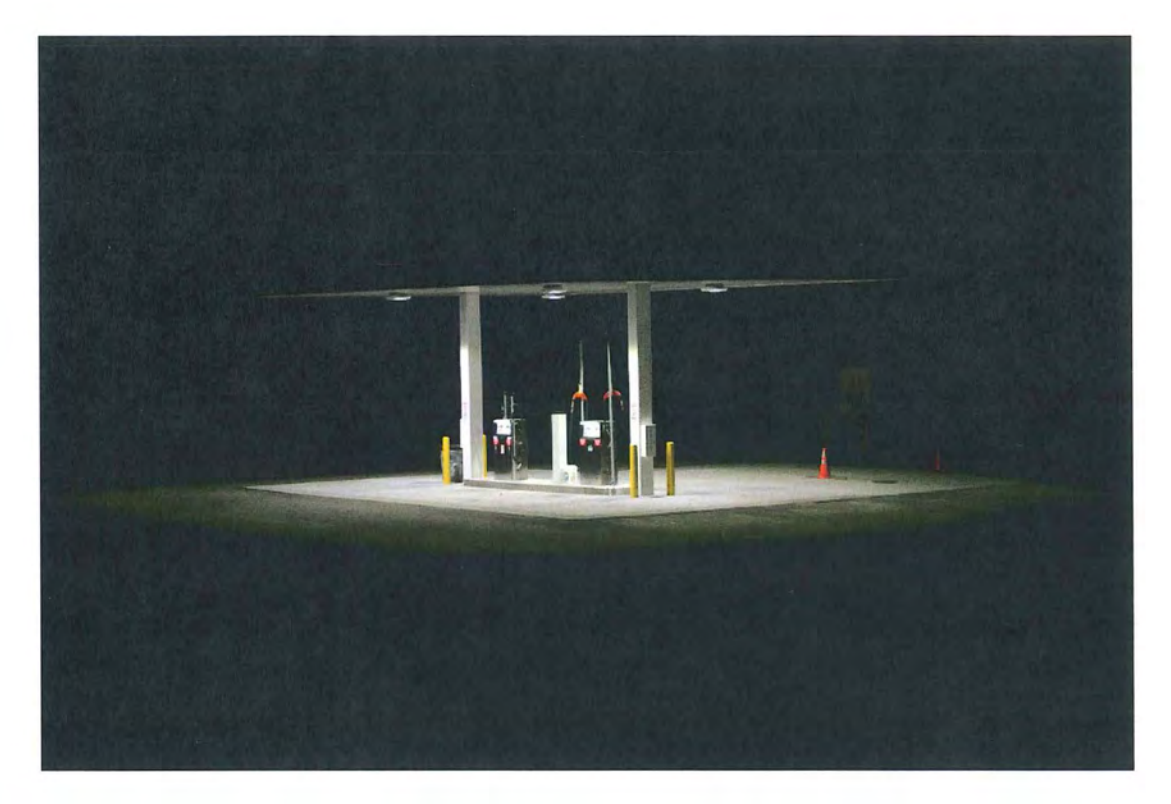
Sample photo of typical fuel island canopy at night