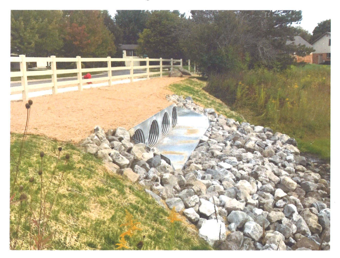
New one-piece headwall and elliptical culverts on east-side of Christina Lane.