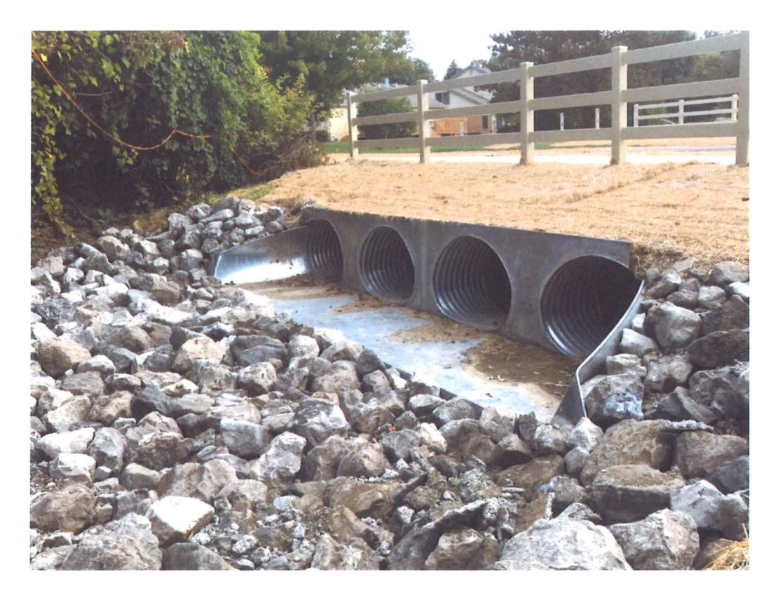
New one-piece headwall and elliptical culverts on west-side of Christina Lane.