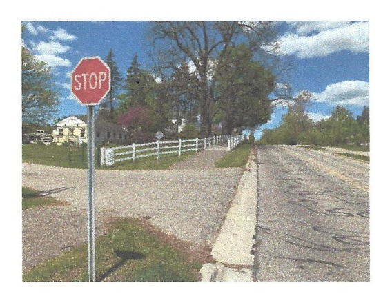
Figure 2: Current South Driveway with restricted street view. Looking north toward 13 Mile.