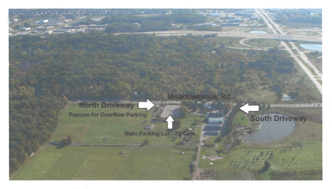
Figure 1: Current Tollgate entrances.

Tollgate's South entrance, located at the bottom of a hill with a restricted view of south-bound Meadowbrook Road traffic, will be used as a service entrance.