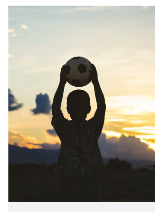
FOCUSED ON IMPACT

Anticipating and responding to change is a major distinction of McKenna's practice. Often, even experienced public officials or business leaders must face new challenges. In other instances, the challenges are more familiar, but new approaches are needed. In either case, McKenna's innovation and depth of experience is a resource for public and private decision-makers.