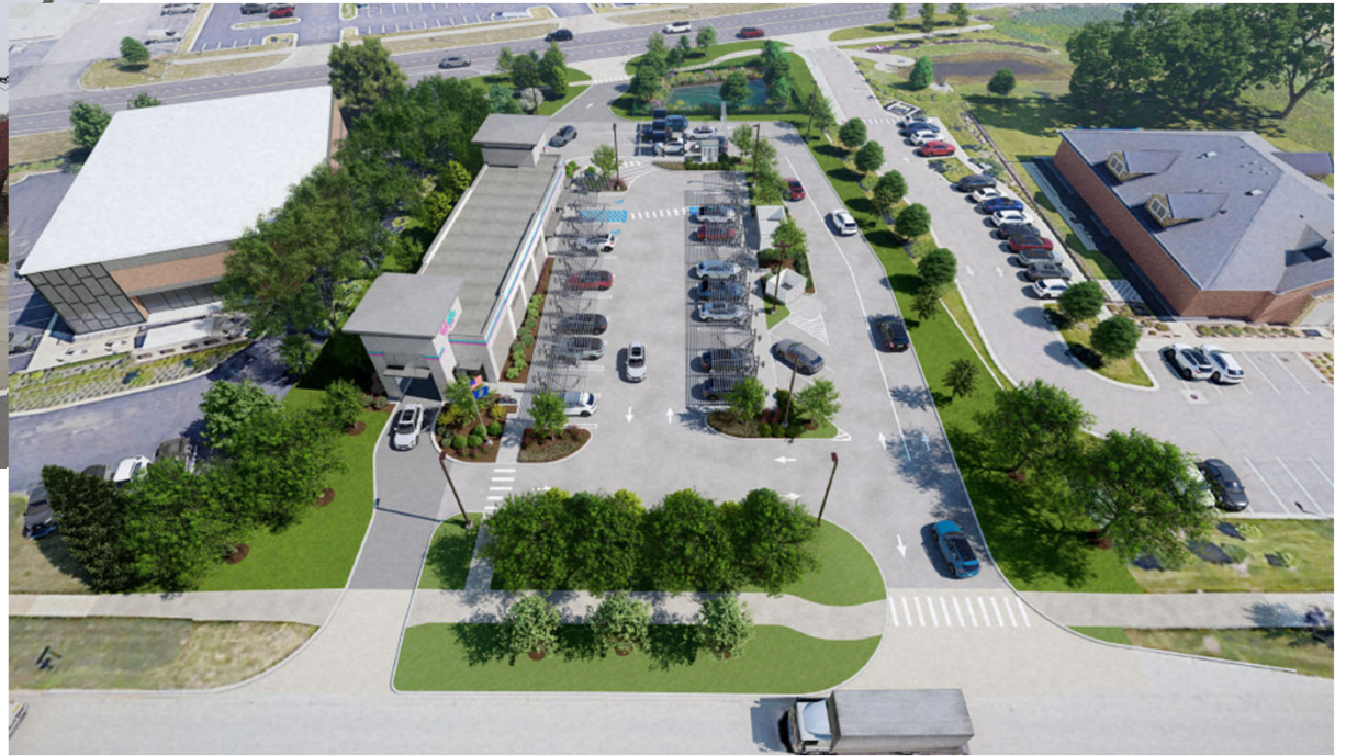
4 – El Car Wash, Grand River Ave & 12 Mile (Under Construction)