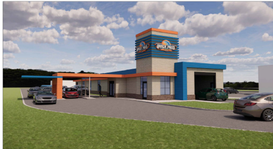
301 SOUTHEAST RENDERING A300 SCALE: NO SCALE