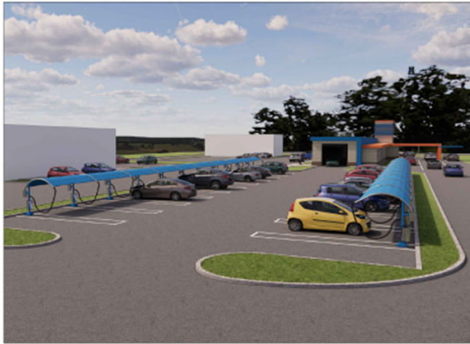
303 VACUUMS RENDERING A300 SCALE: NO SCALE