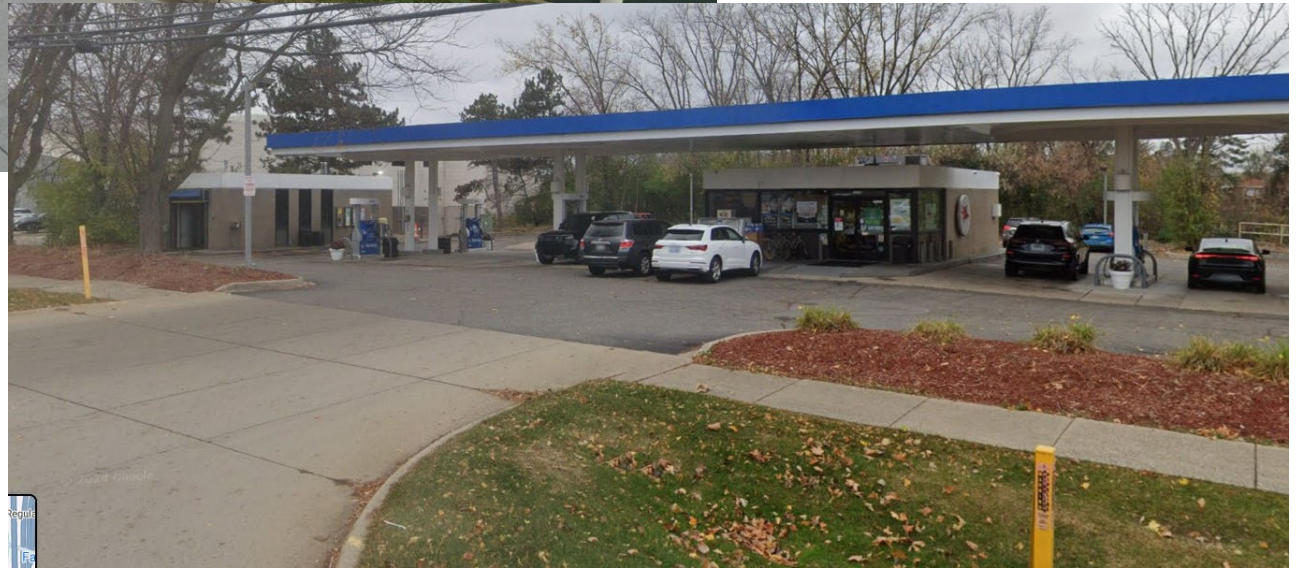
6 – Mobile Gas Station with accessory car wash, Grand River & Haggerty