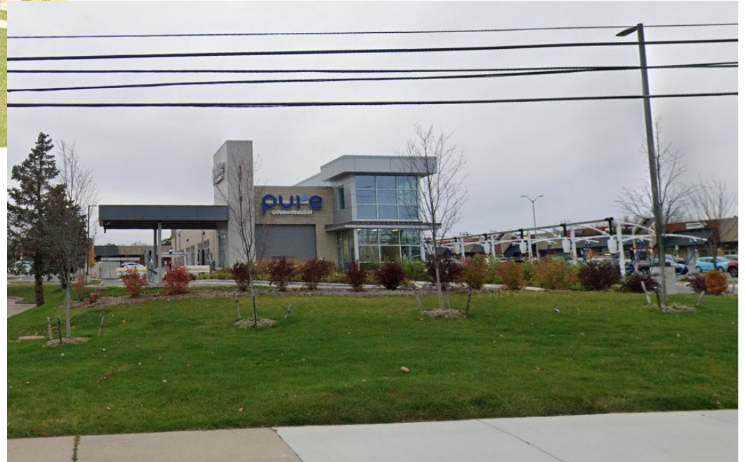
2 – Pure Wash, Meadowbrook Road & 10 Mile