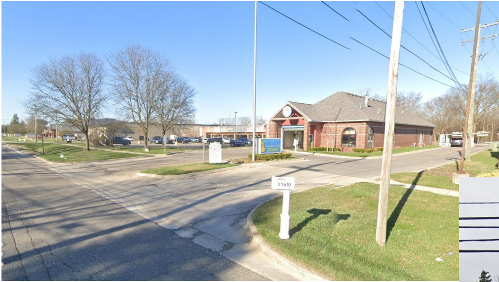
1 – Squeaky Shine, Novi Road