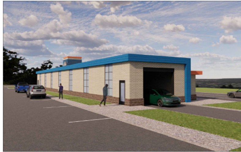
302 NORTHWEST RENDERING A300 SCALE: NO SCALE