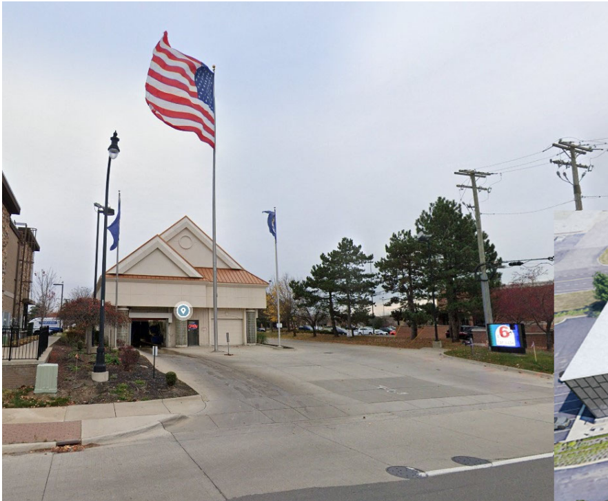
3 – Original $6 Car Wash, Novi Road (Proposed rebranding to El Car Wash)