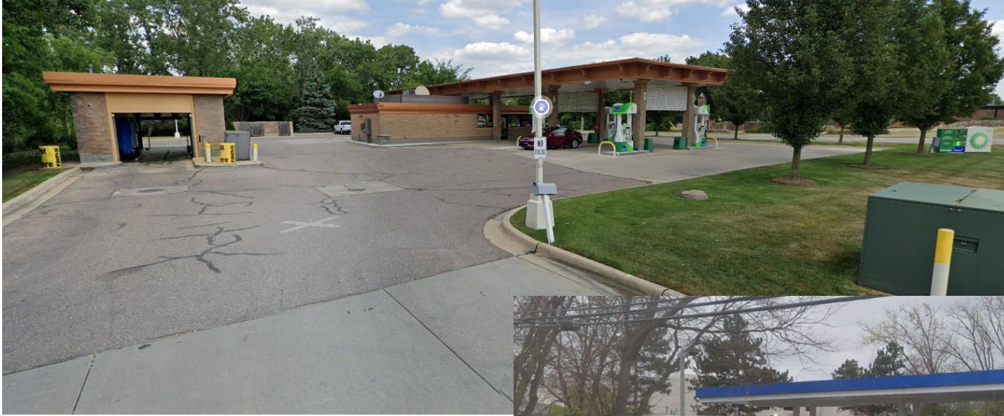
5 – BP Gas Station with accessory car wash, 12 Mile and Novi Road