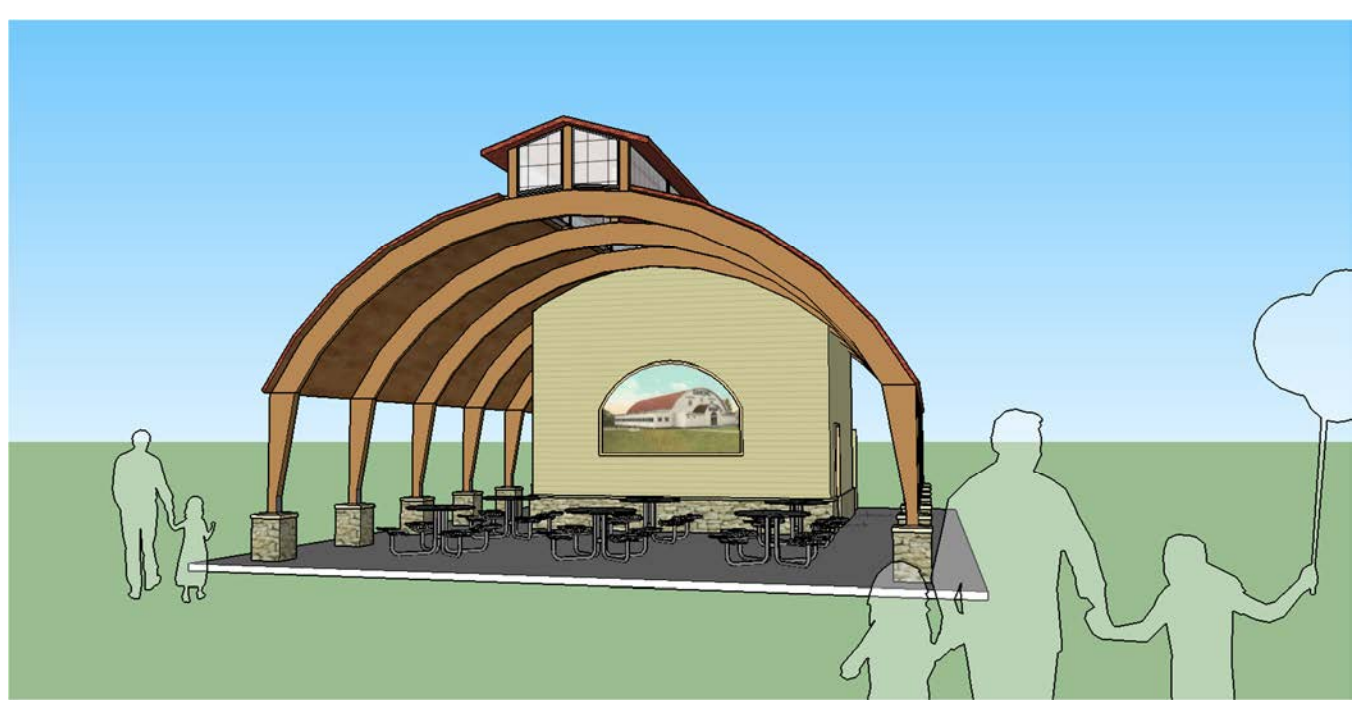
Figure 5: Perspective of seating area within proposed pavilion.