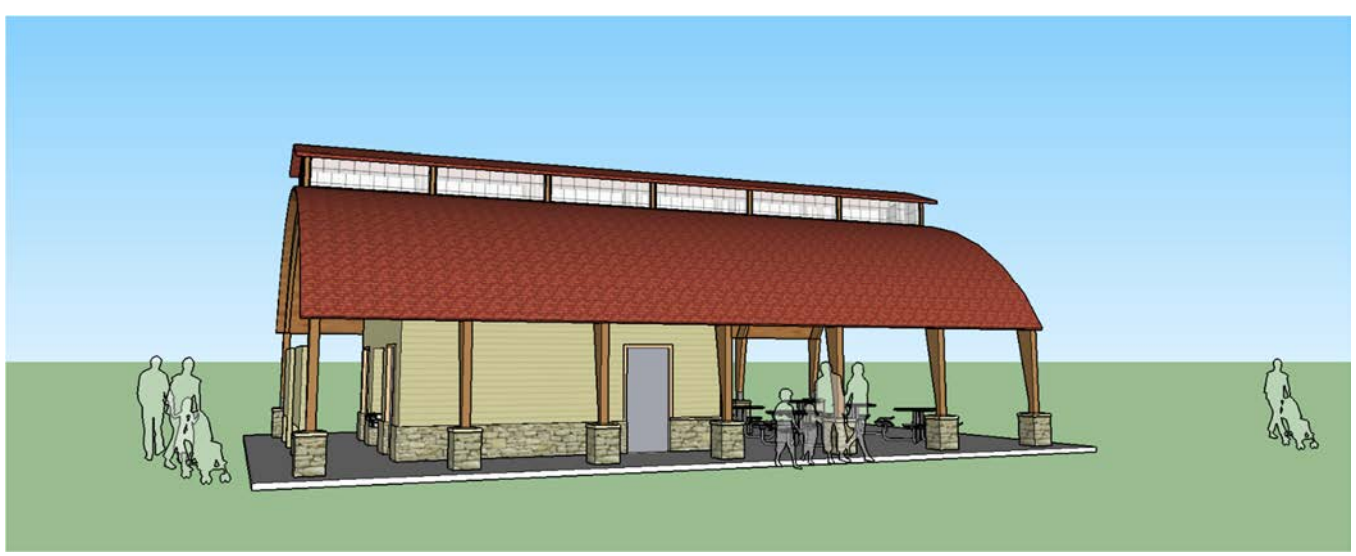
Figure 4: Perspective of proposed pavilion.

asphalt roof shingles of the new pavilion are anticipated to be of a red tone to recall the roof of the original casino dance hall.