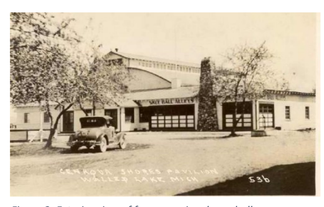
Figure 2: Exterior view of former casino dance hall

the new park pavilion aesthetic. When the casino dance hall was rebuilt in the 1920's, the clerestory element was added to the roofline (fig. 2). This clerestory provided additional architectural detail that helped further define the building's aesthetic. The current pavilion design also incorporates this clerestory structure, along with the strong curved characteristic of the roof (fig. 4).