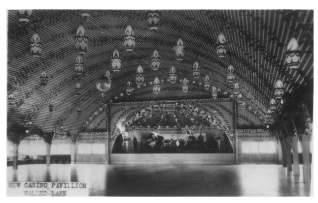
Figure 3: Interior of former casino/dance hall

In addition to the profile of the original main roof, the design team also noted the smaller curved roof above the original entry (fig. 1). The team utilized this element in the form of an applied graphic element that is located along the west wall of the seating area (fig. 5).