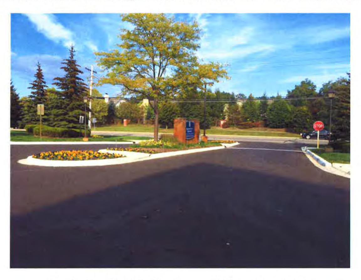
Meadowbrook Commons entrance off Meadowbrook Road