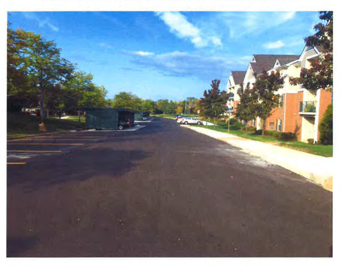
New parking lot asphalt, car port concrete, and replaced concrete sidewalk