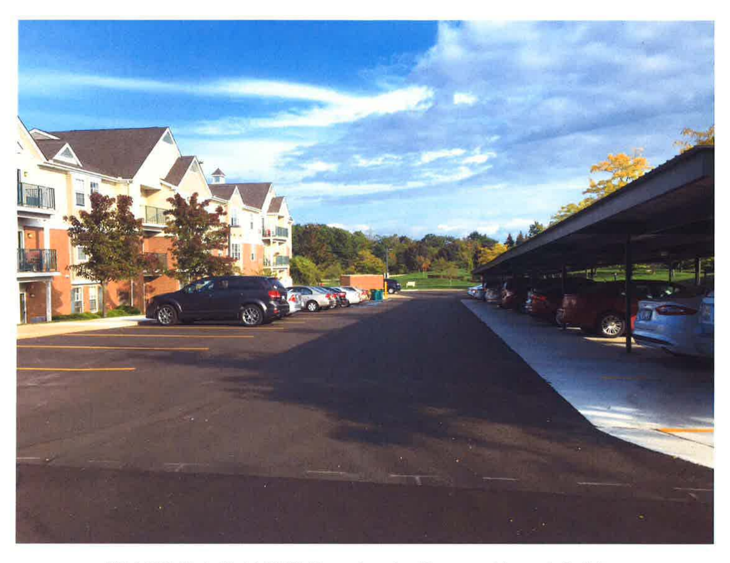
New asphalt, curb, concrete car port pads at the rear of the main building.