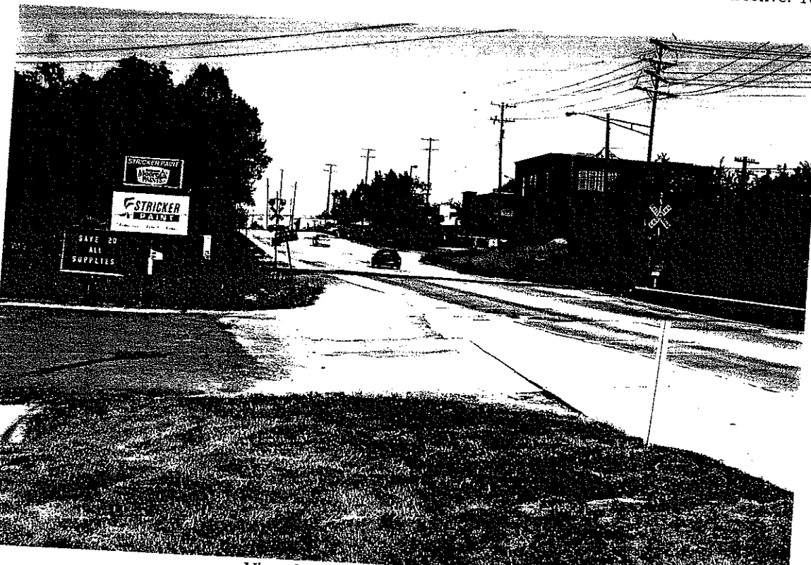
View from Novi Road frontage (looking north)