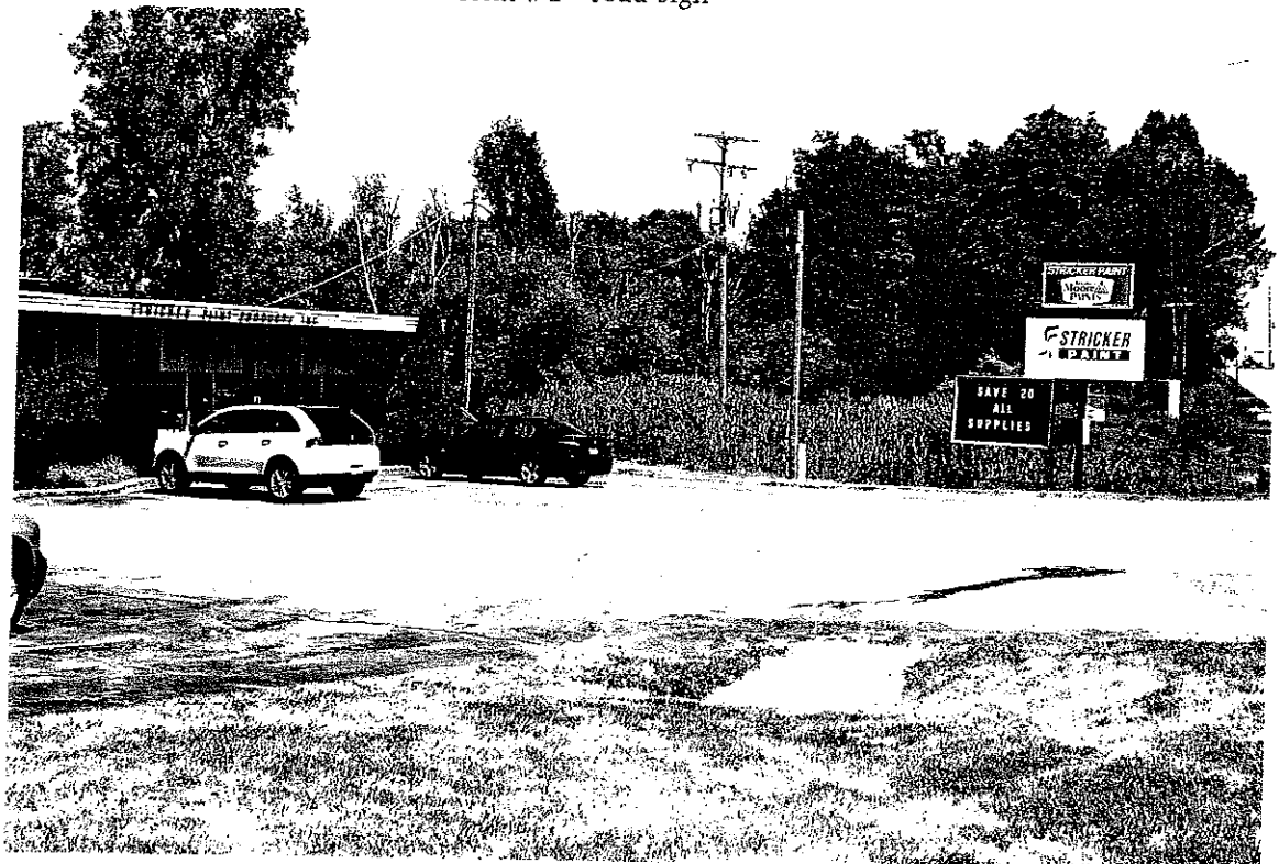
View from Novi Road frontage (looking northwest)