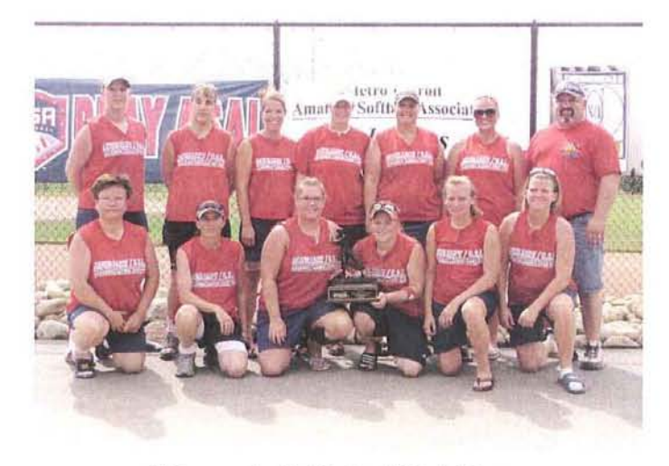
Women's E State Third Place American Legion