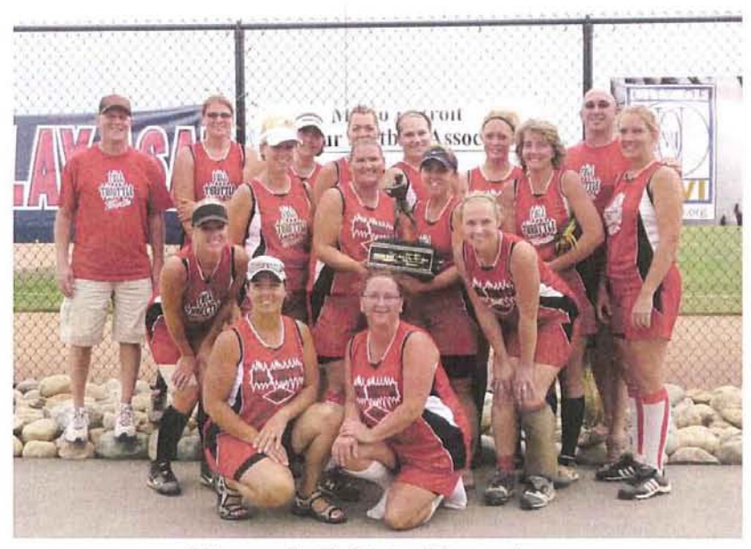
Women's E State Champions Full Throttle

The City of Novi hosted the Michigan Amateur Softball Association's 2009 Women's "E" State Slow Pitch Championships Saturday, August 1. Teams from around the state played at Ella Mae Power Park to stake their claim as the best team in Michigan.