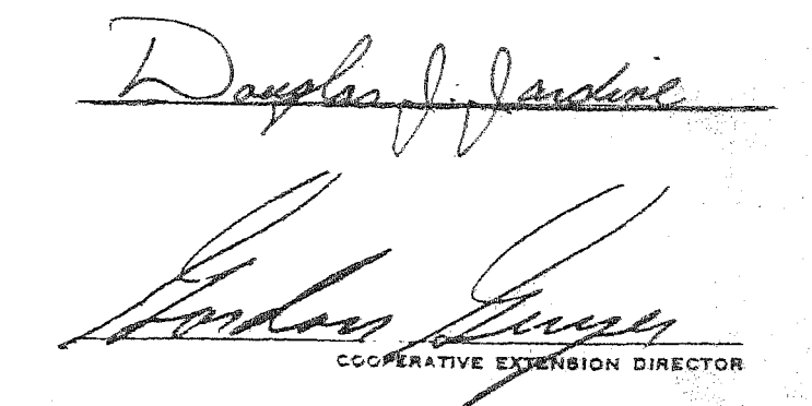
EXHIBIT A Page 7 of 30

and in recognition of leadership abilities for extending this information