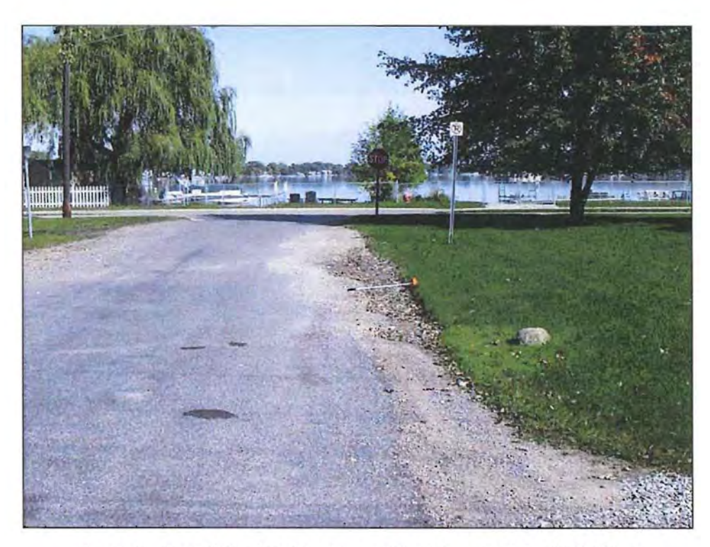
Figure 5. East Side of Buffington on Final Approach to STOP Sign