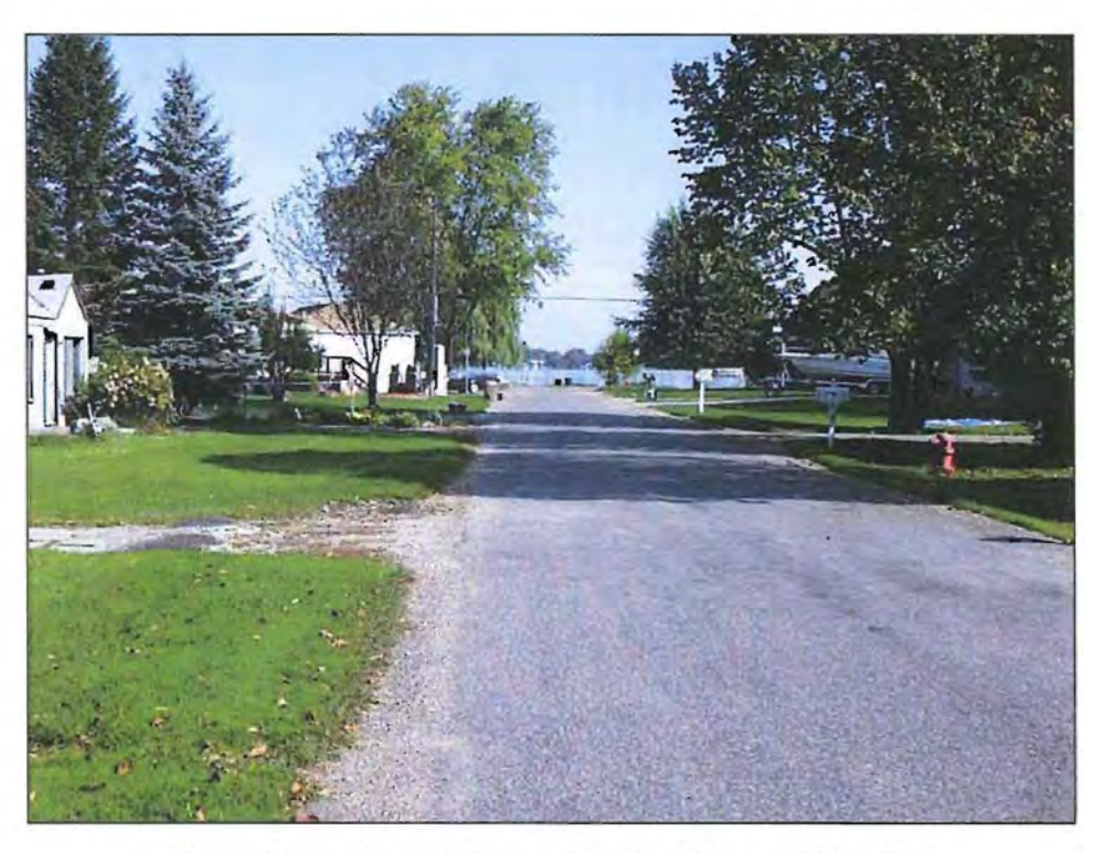
Figure 3. Looking North from 200 Feet North of Lilley Trail