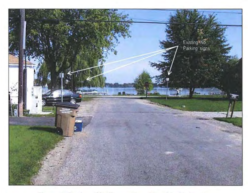
Figure 4. Portion of Buffington Considered for No Parking