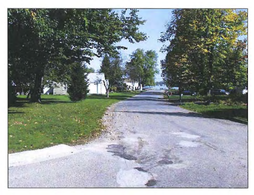
Figure 2. Looking North Along Buffington Drive from Lilley Trail