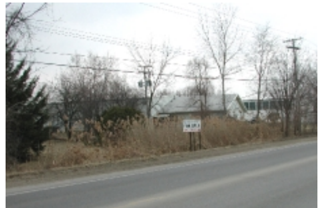
Higher quality woodland and wetland systems Important to enhance and preserve