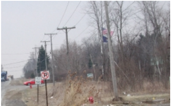
Higher quality woodland and wetland systems Important to enhance and preserve