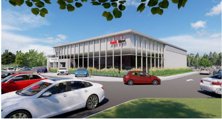
Figure 5: Audi of Novi Rendering, as provided by the applicant.

Public Hearing at the request of Lithia Motors, Inc. for approval of the Preliminary Site Plan, Special Land Use Permit, and Stormwater Management Plan. The subject property is approximately 3.91 acres and is located at the northwest corner of Ten Mile Road and Haggerty Road in the B-3, General Business Zoning District. The applicant is proposing to demolish a former Jaguar Car Dealership and redevelop the site in order to build an approximately 11,935 square foot two-story car dealership building to be used by Audi of Novi along with associated parking, vehicle inventory, and site improvements.