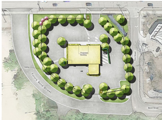
Figure 3: City Center Office Plaza Plans, as provided by the applicant.

Consideration of the request of City Center Office Plaza, LLC for approval of the Preliminary Site Plan and Stormwater Management Plan. The subject property contains 1.25 acres and is in Section 15, on the west side of Flint Street, south of Grand River Avenue. The applicant is proposing a three-story office building with a bank on the first floor and general office on the upper floors (15,300 square feet total). The site plan includes a two-lane drive-through for the bank use on the south side of the building.