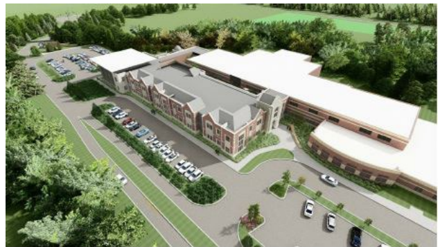
Figure 1: Catholic Central STEM Addition Rendering, as provided by the applicant.

Public hearing at the request of Catholic Central High School for Planning Commission's approval of revised Special Land Use Permit, Preliminary Site Plan, Woodland Permit and Stormwater Management Plan. The subject property is zoned R-4 One Family Residential, R-1 One Family Residential, and I-1 Light Industrial and is located in Section 18, west of Wixom Road and south of Twelve Mile Road. The applicant is proposing to construct a 54,545 square foot addition to the main school building to house their Science Technology Engineering and Mathematics (STEM) classrooms and labs. Existing parking areas would be reconfigured.