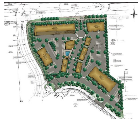
Figure 2: Griffin Novi Plans, as provided by the applicant.

Public hearing at the request of Singh Development, LLC for JSP 20-27 Griffin Novi for Planning Commission's recommendation to the City Council for approval of a Preliminary Site Plan with a PD-2 Option, Special Land Use permit, Wetland Permit, and Stormwater Management Plan approval. The subject property is located at the southeast corner of Twelve Mile Road and Twelve Oaks Mall access drive in Section 14. The applicant proposes to utilize the Planned Development 2 (PD-2) option to develop 174 multi-family residential units. A private street network is proposed to connect the development to Twelve Mile Road and the Twelve Oaks Mall access drive on the west side of the property.