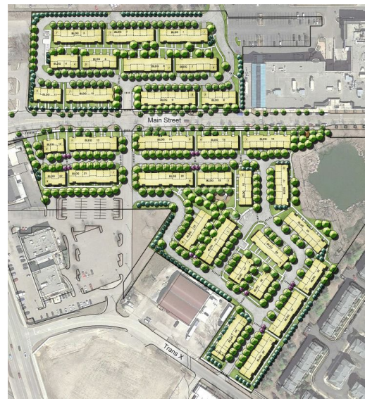
Figure 4: Townes of Main Street Plans, as provided by the applicant.

Public hearing at the request of Singh Development for JSP 20-35 Townes of Main Street for recommendation to the City Council for approval or denial of Preliminary Site Plan, Phasing Plan, Wetland Permit, and Storm Water Management Plan. The subject property is zoned TC-1 (Town Center One) and is approximately 17.7 acres. It is located north and south of Main Street, east of Novi Road, in Section 23. The applicant is proposing a multifamily development with 192 townhouse-style apartments. The site improvements include a private street network, surface parking, and related open space amenities. The applicant is proposing construction in three phases.