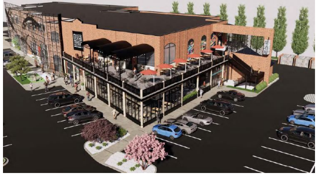
Figure 7: Noble Village Rendering, as provided by the applicant.

Consideration of Noble Village at the request of Detroit Architectural Group for approval of the Preliminary Site Plan. The subject site contains 3.85 acres and is located at 42705 Grand River Avenue, east of Novi Road, and south of Grand River Avenue, which is in Section 23. The applicant is proposing a range of improvements to the current site of One World Market and the former Library Pub. These improvements include major changes to the façade of the building, landscape changes, and a total of 2,170 square feet in building additions to accommodate a few new uses of the site including an expanded Asian Grocery Store (One World Market), an Asian food hall anchored by Noble Fish Sushi and White Wolf Japanese Patisserie, an Izakaya bar, and community meeting spaces on the second and third floor of the building.