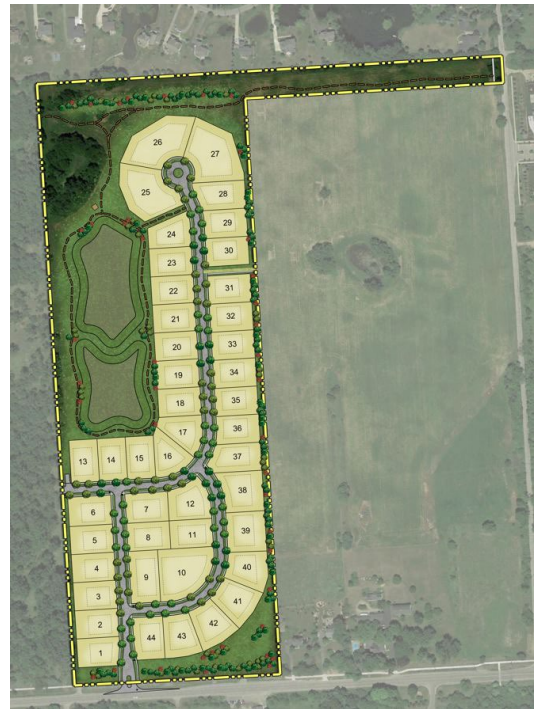
Figure 6: Parc Vista Plans, as provided by the applicant.