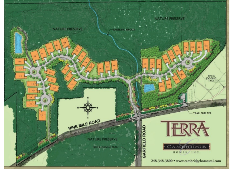
Figure 3: Terra Site Plan