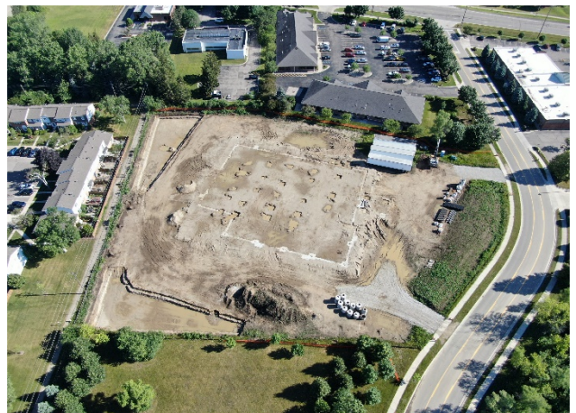
Figure 2: ASI of Novi 6/22/2021