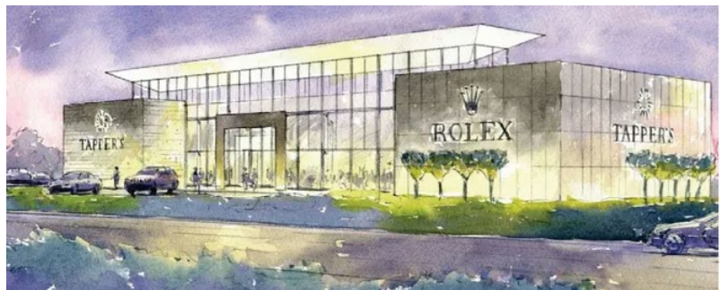
Figure 4: TFJ of Novi - hometownlife.com

Consideration of the request of Broder and Sachse Real Estate for approval of the Preliminary Site Plan and Stormwater Management Plan. The subject property contains 1.16 acres and is located in Section 36, on the east side of Haggerty Road, north of Eight Mile