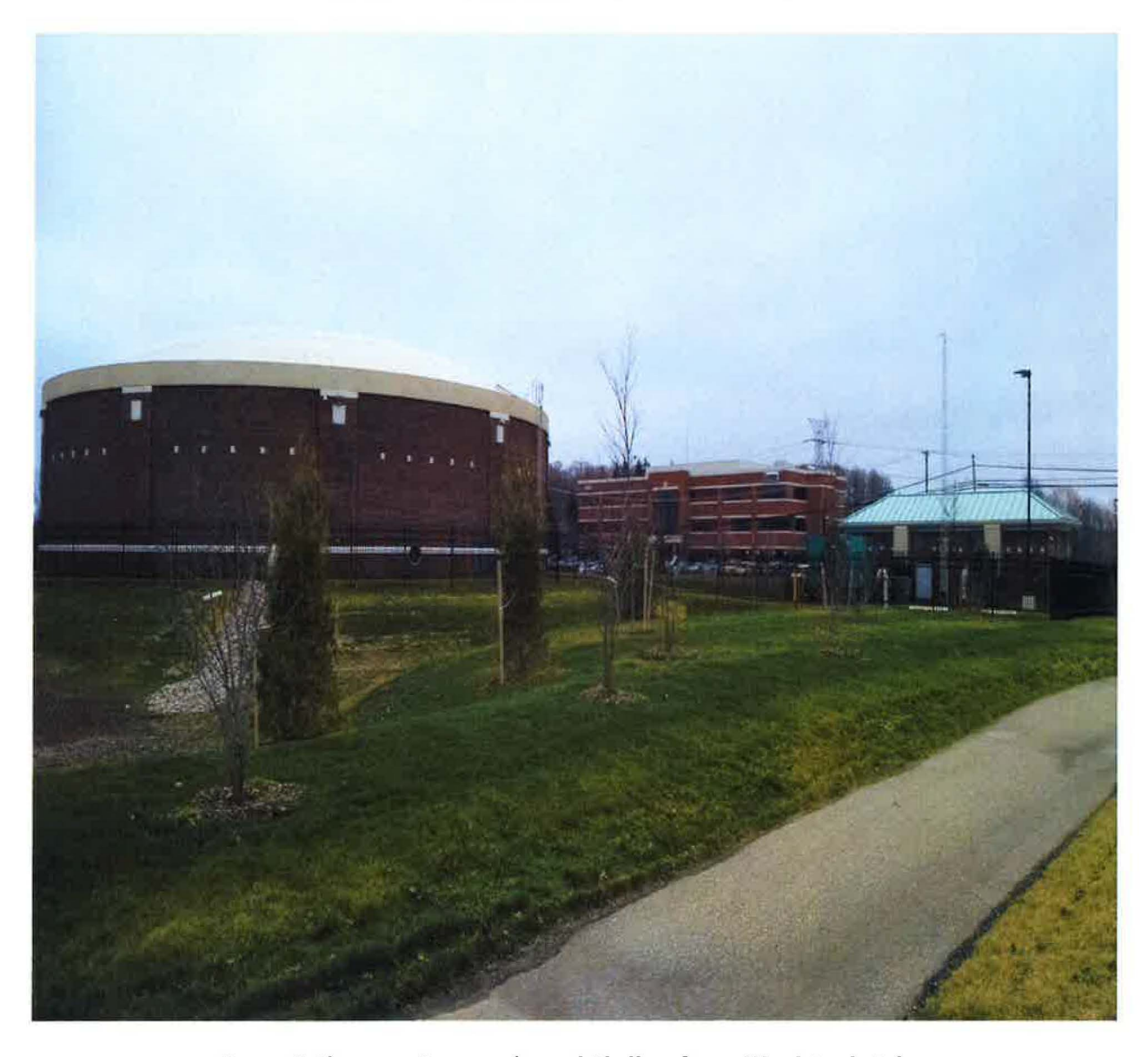
Overall Storage Reservoir and Station from West Park Drive