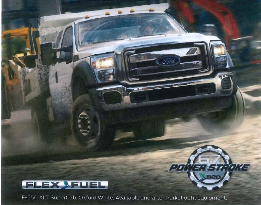
F-550 XLT SuperCab, Oxford White. Available and aftermarket upfit equipment.

Chassis Cab Class Models: XL, XLT, LARIAT