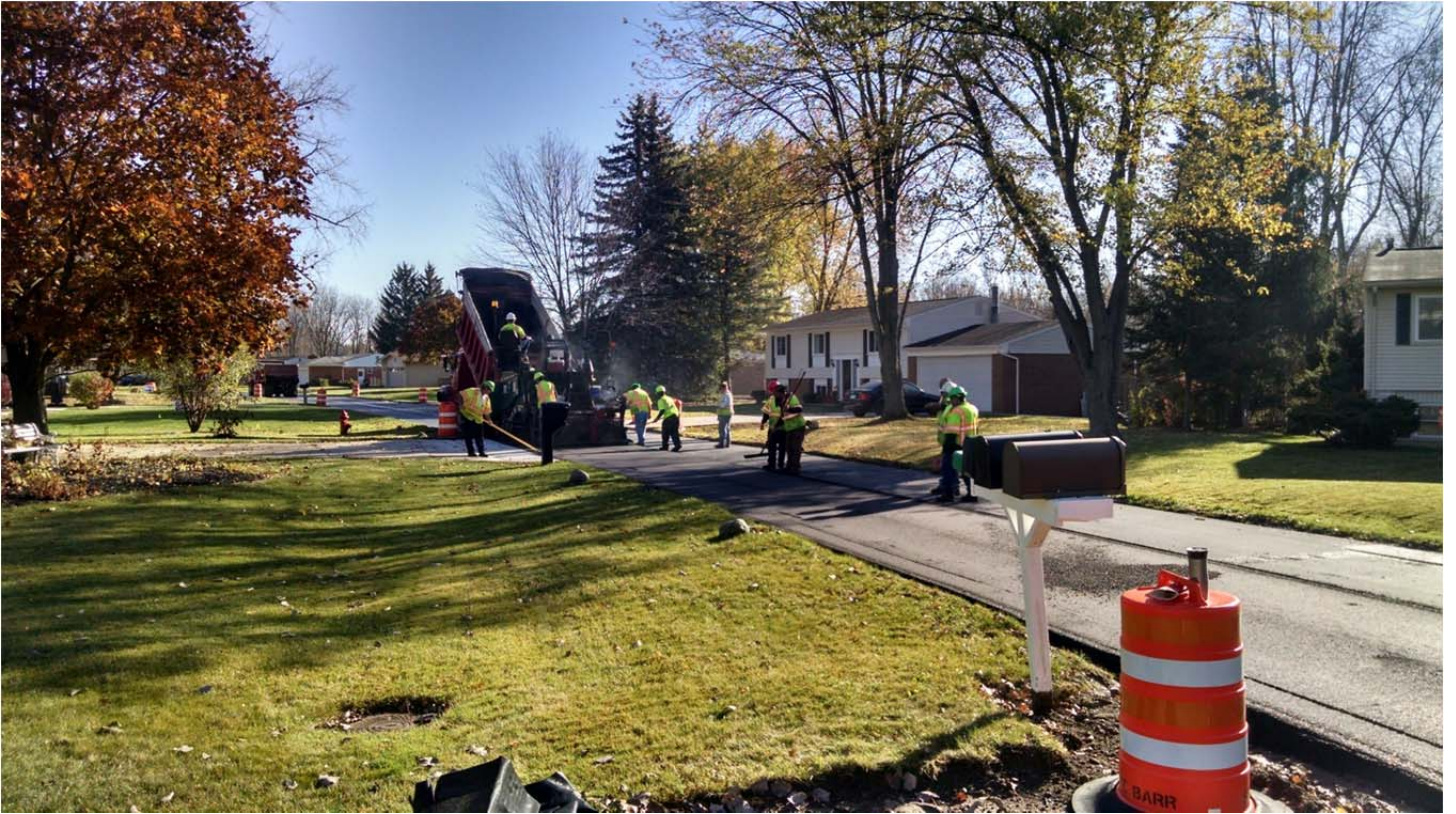
Asphalt interlayer and top paving on Sycamore Drive.