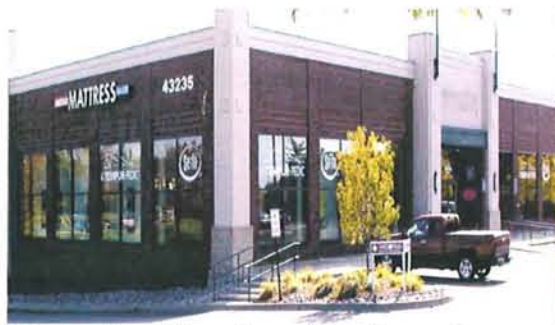
View of building from 12 mile road