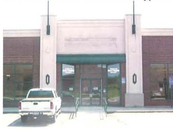
Front Door entrance

Novi Zoning Board of Appeals: We are asking for a sign variance to install a sign over our front doors and use of the pylon sign to the south of building on the ring road.