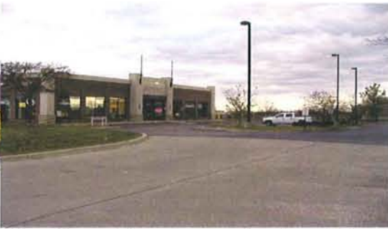
View from driveway entering from 12 mile

With out signage over our front door we daily have people coming to the door with rugs for Hagopian and cars enter off 12 mile and go south along the front of building which is where our only signage exists and wind up at Hagopian's front door or down on the ring road and unsure how to return to our store.