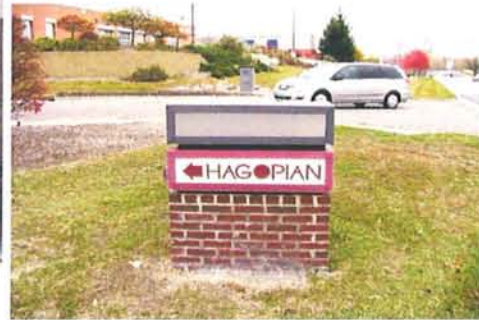
Ring Road Sign