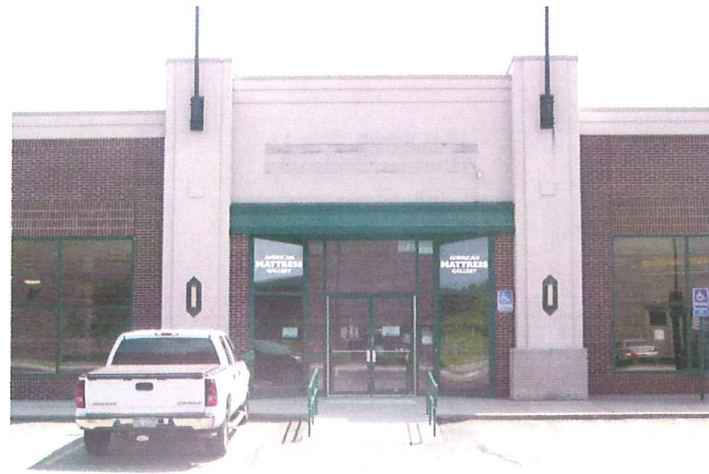
CURRENT STORE FRONT