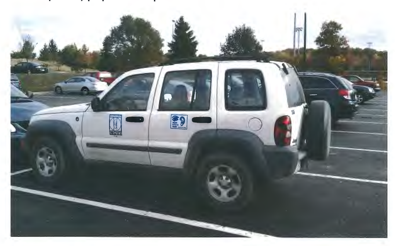
2005 Jeep Liberty proposed for replacement