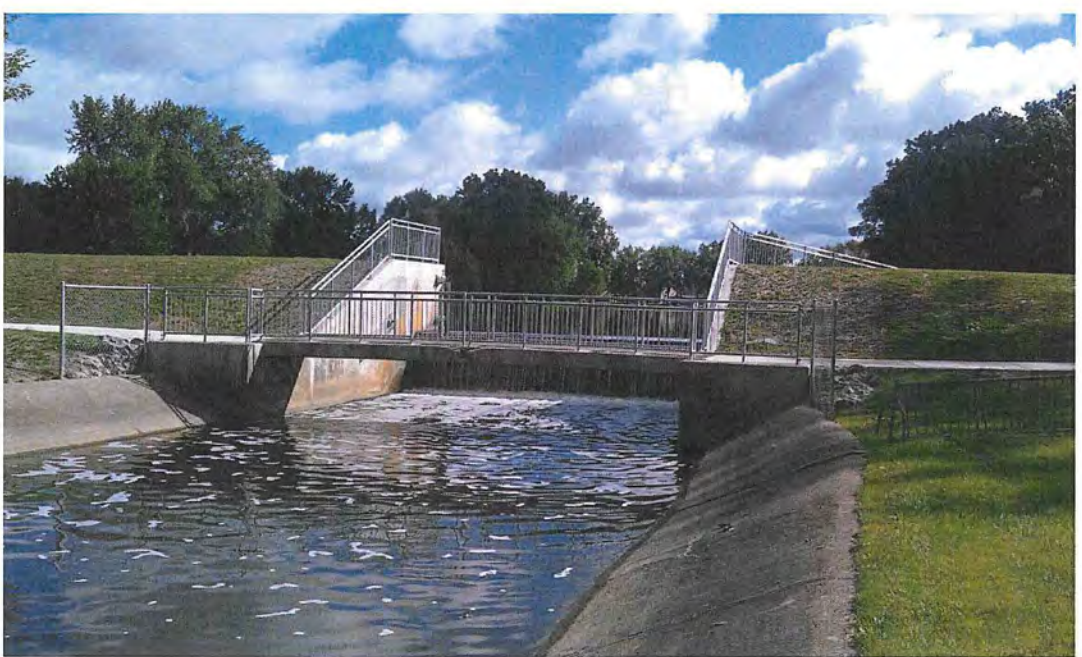
Looking north at the dam