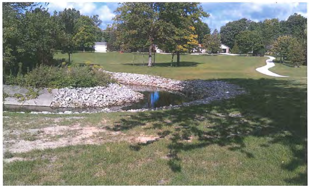
Streambank stabilization along the Rouge River