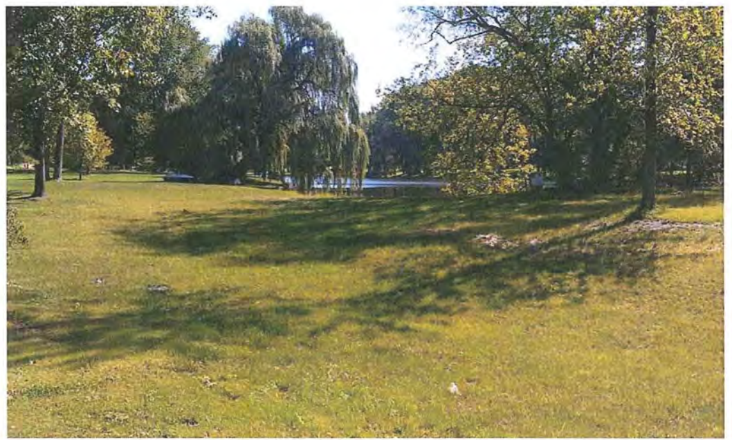
Looking north at the lake secondary overflow swale