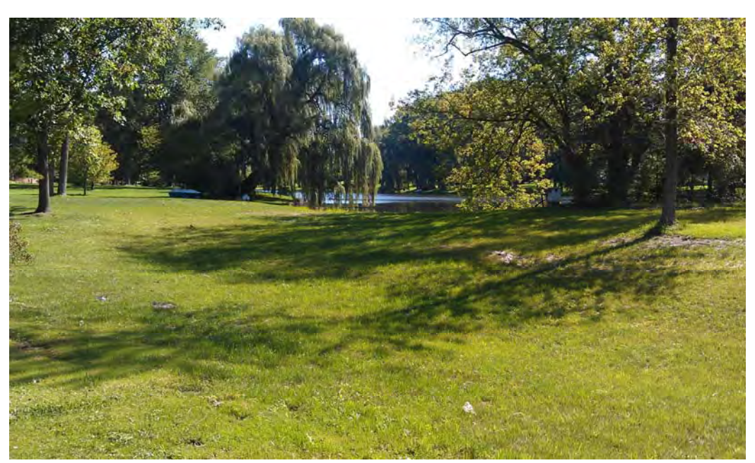
Looking north at the lake secondary overflow swale