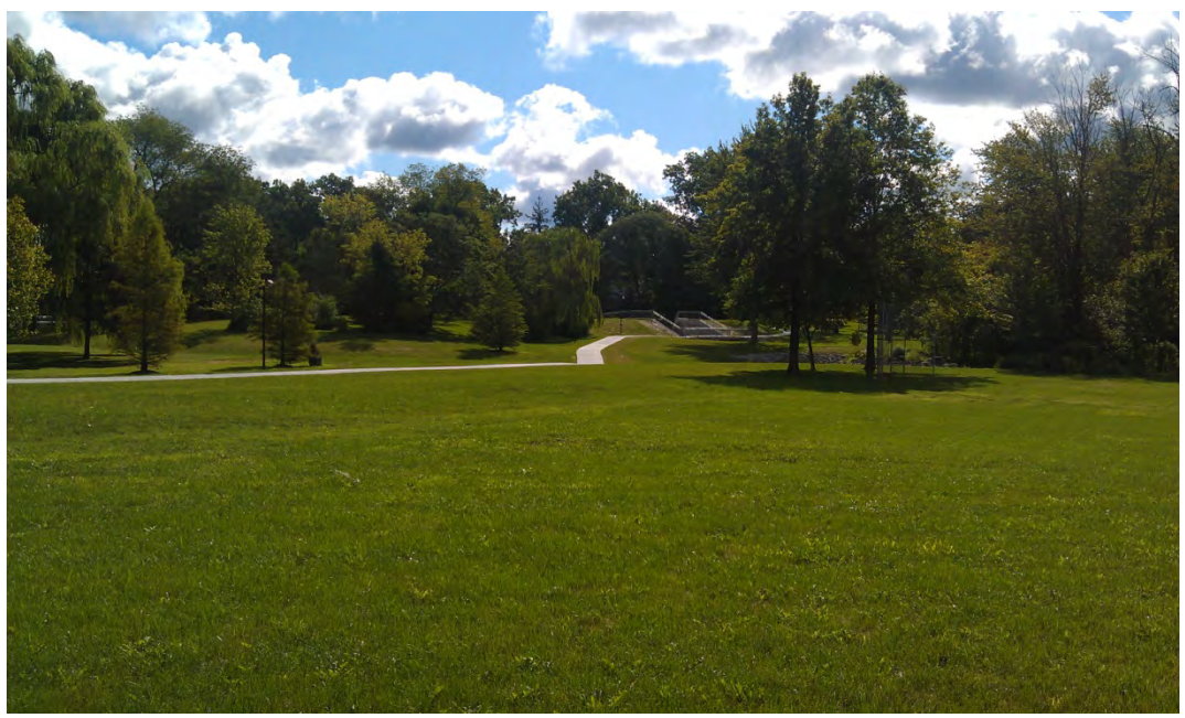
View from Ennishore Drive looking east