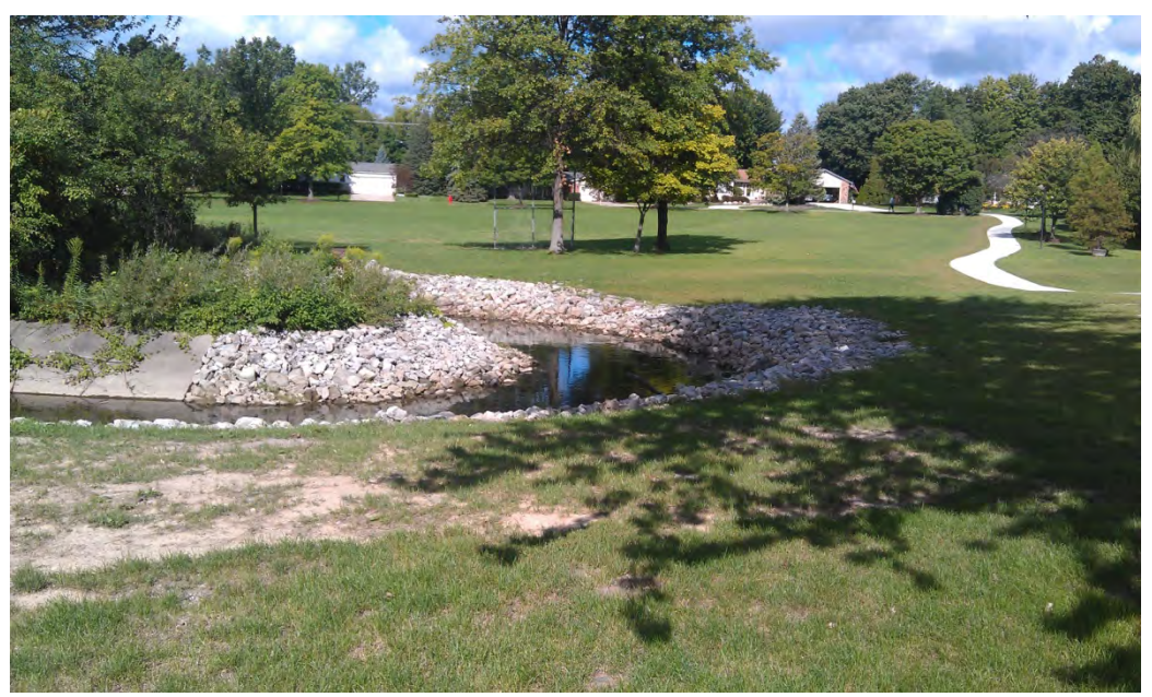
Streambank stabilization along the Rouge River