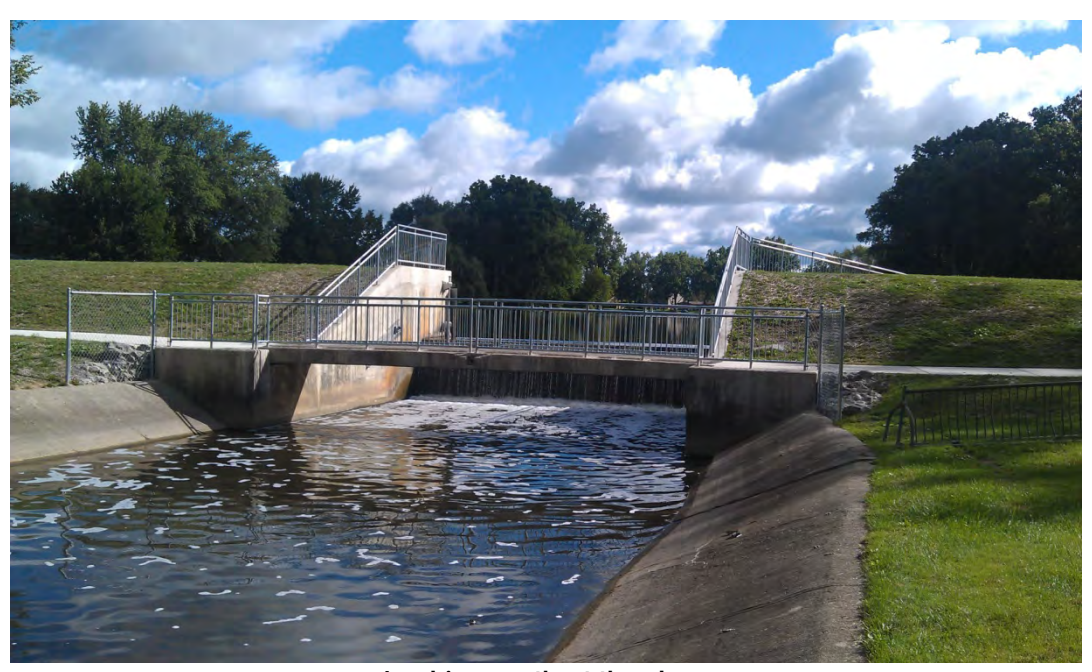
Looking north at the dam