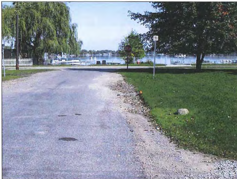
Figure 5. East Side of Buffington on Final Approach to STOP Sign