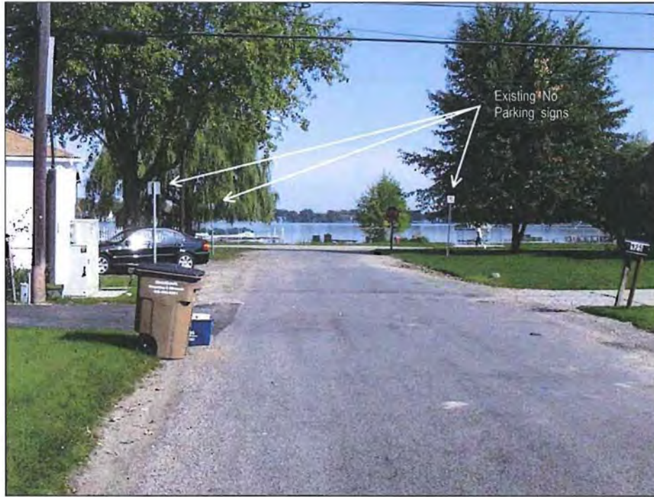
Figure 4. Portion of Buffington Considered for No Parking