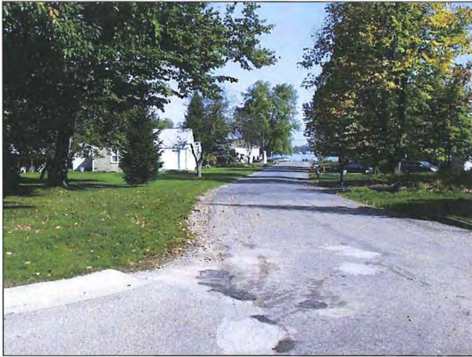
Figure 2. Looking North Along Buffington Drive from Lilley Trail