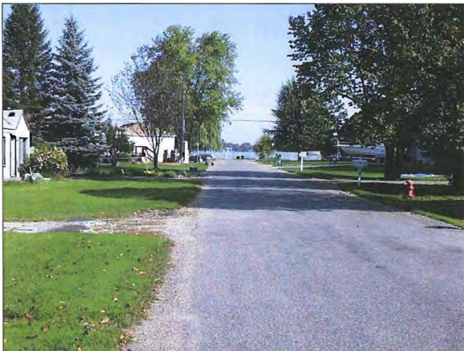
Figure 3. Looking North from 200 Feet North of Lilley Trail