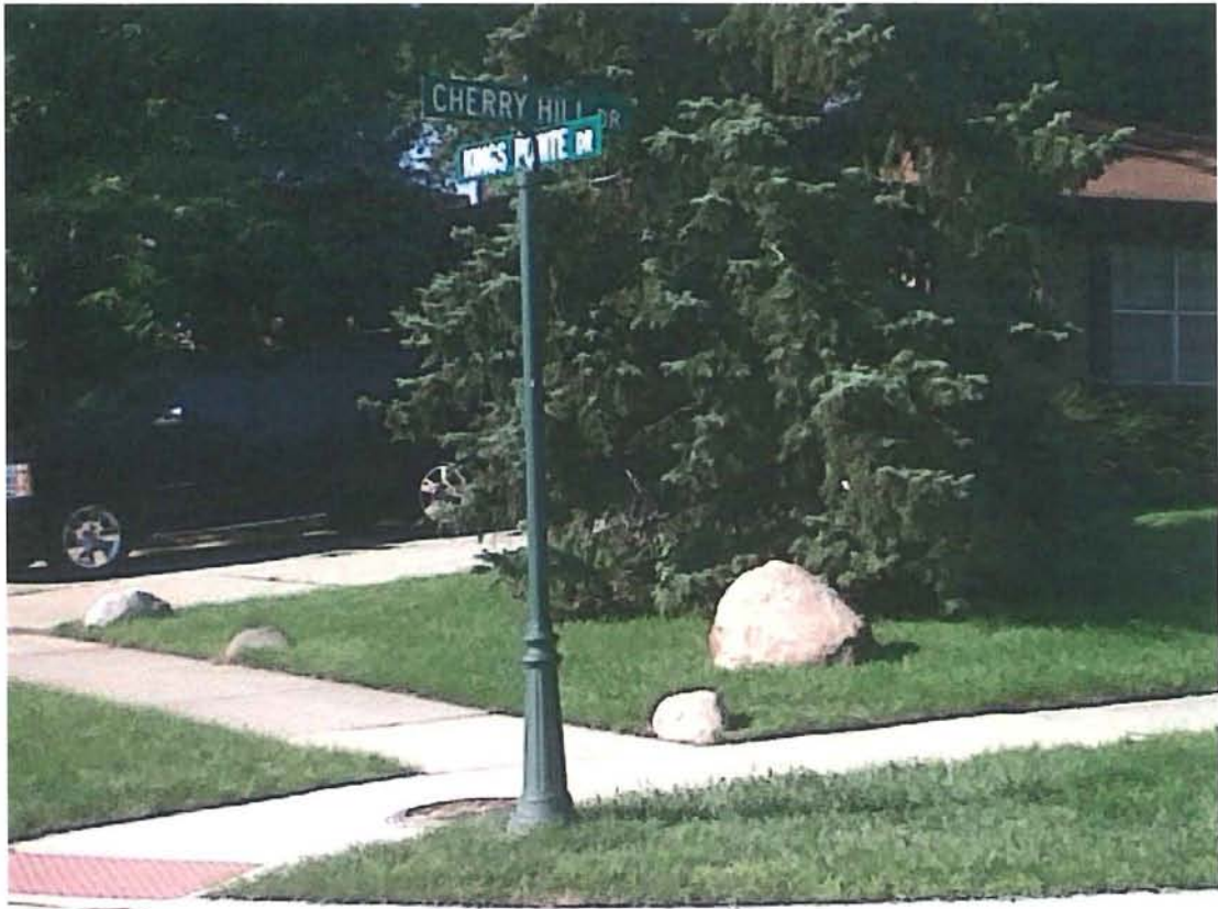
Proposed Decorative Sign Post in Meadowbrook Glens