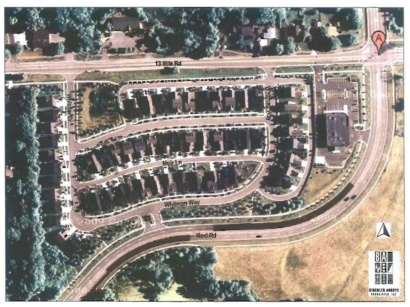
Figure 1. Camden Court