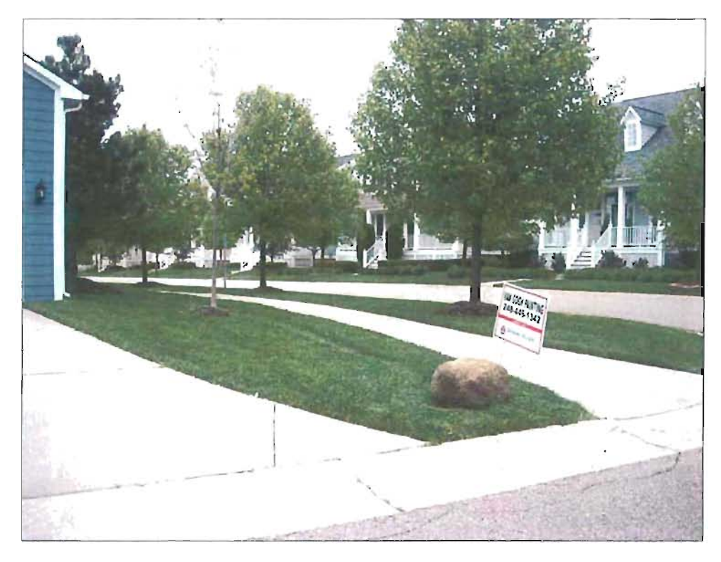
Figure 7. Looking Northeast at Corner of Muir Lane and Whitman Way