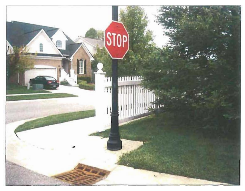
Figure 2. Looking Northwest at Corner of Muir Lane and Whistler Drive