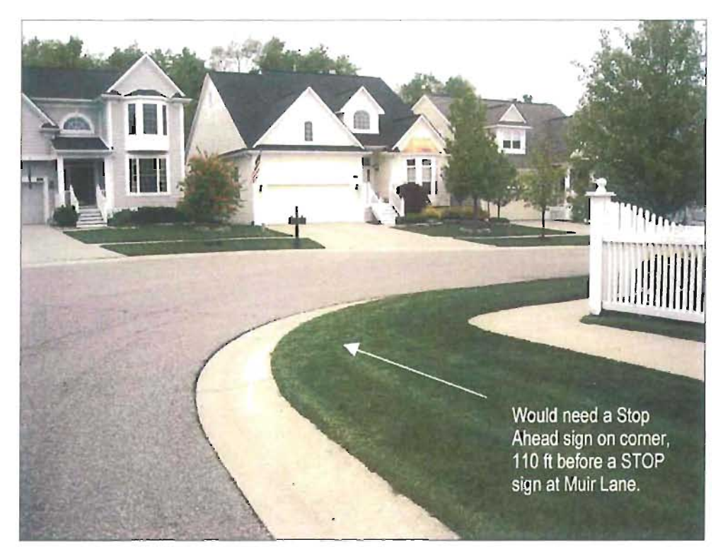
Figure 4. Rounding Corner from Whitman Way to Whistler Drive