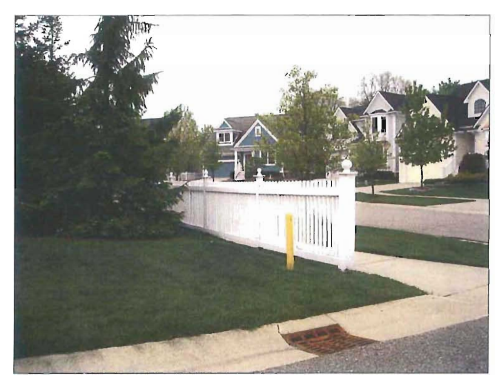
Figure 3. Looking Southwest at Corner of Muir Lane and Whistler Drive