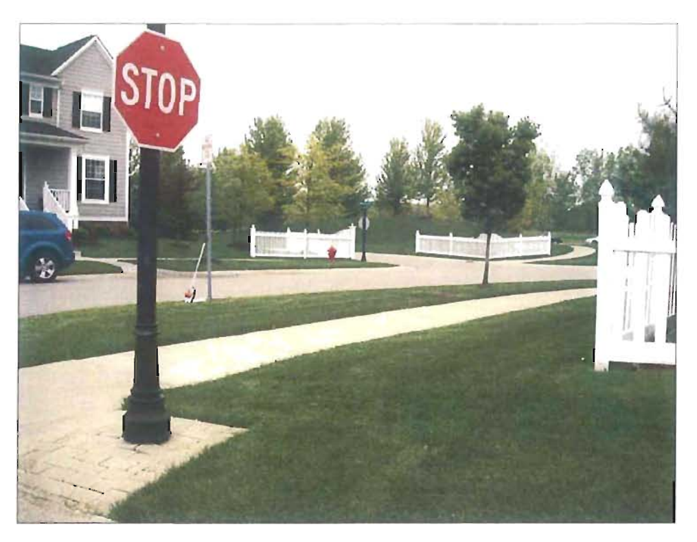
Figure 6. Looking Southeast at Corner of Muir Lane and Whitman Way