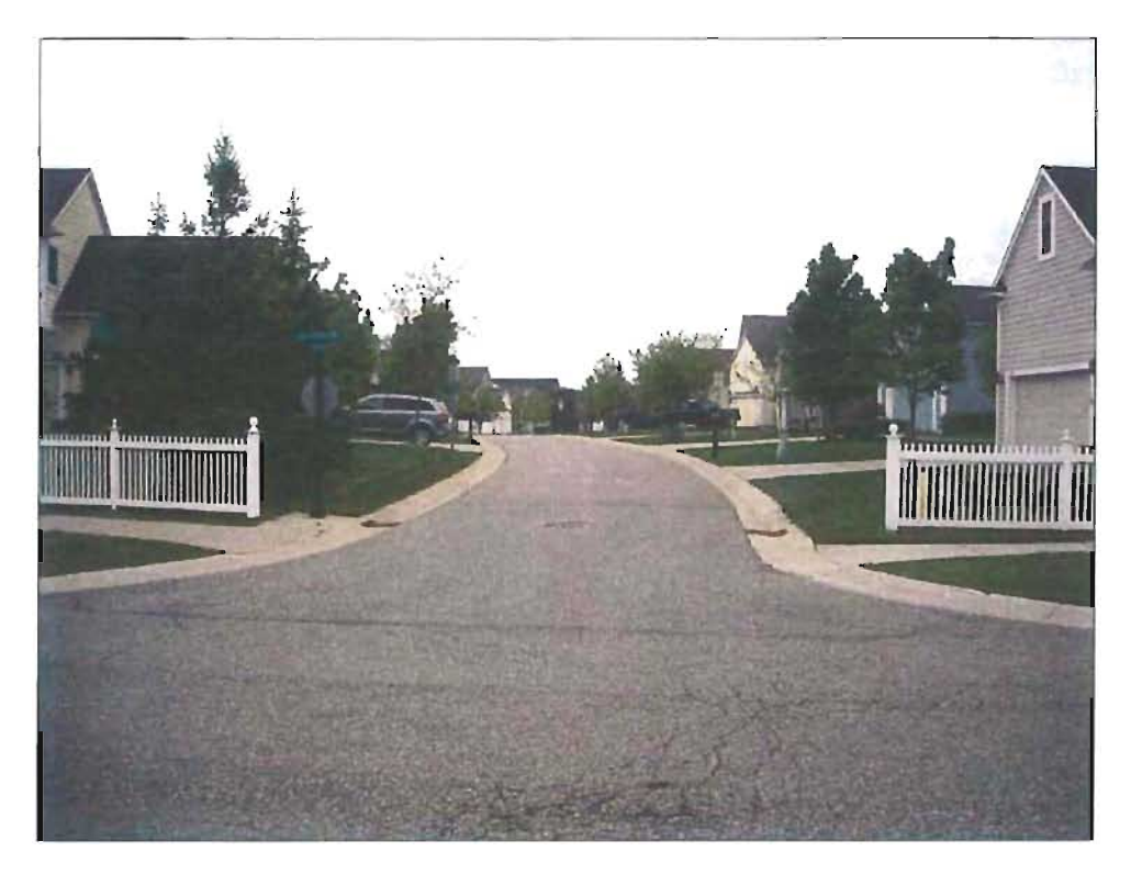
Figure 5. View to East Down Muir Lane