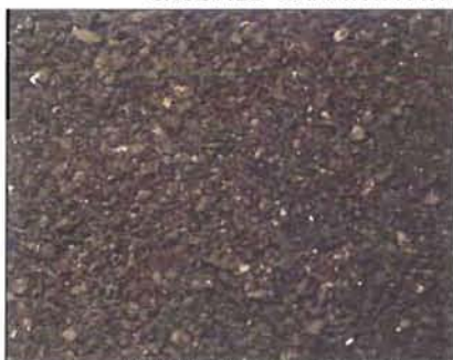
Kafka 'Stabilizer' Pathway mix with integral binder, Color: 'Starlite Black'