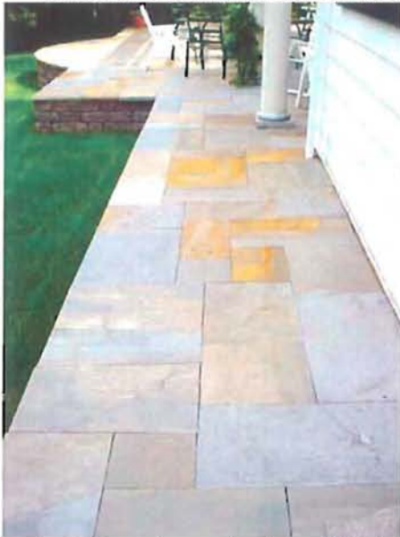
Cut Fieldstone, Rectangular Shapes, 'Full Color'