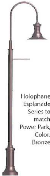
Holophane Esplanade Series to match Power Park, Color: Bronze