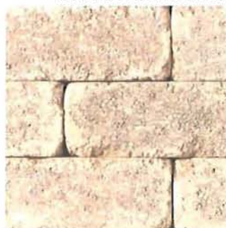
Unilock Brussels Block Paver, Color: 'Sandstone'