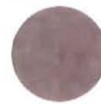
Landscape Forms 'Parc Vue' Bench, backed and backless, Color: Bronze or White