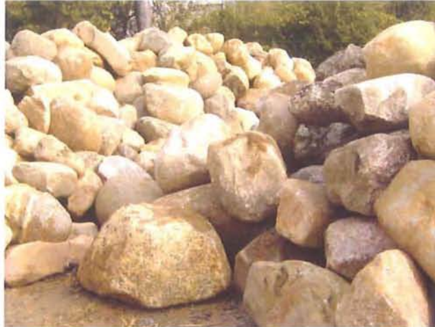
Michigan Fieldstone Boulders, size range: 12"-36"