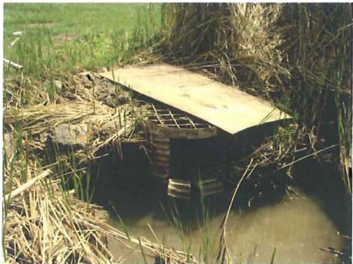
1.1 Sedimentation Control Structure