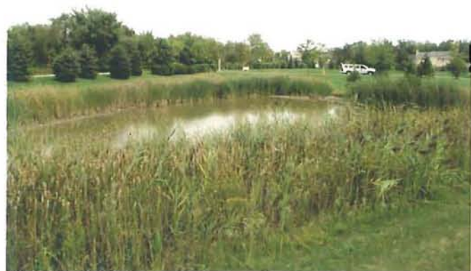
1.2 Detention Pond

A field survey of the detention basin was performed. The top of bank surrounding the basin was field located at approximately elevation 877.0', which is 2' lower than the design freeboard (elevation 879.0'). We do not consider this a significant concern since the grades surrounding the detention pond continue to rise well beyond the 879.0' elevation with no impact to existing facilities (buildings, homes or other structures). Furthermore, the detention basin does not exist in a dedicated easement area for which freeboard limits would be restricted. The inlet pipe locations and elevations are consistent with the original design. The following inconsistencies have been identified to affect the detention volume of the pond: