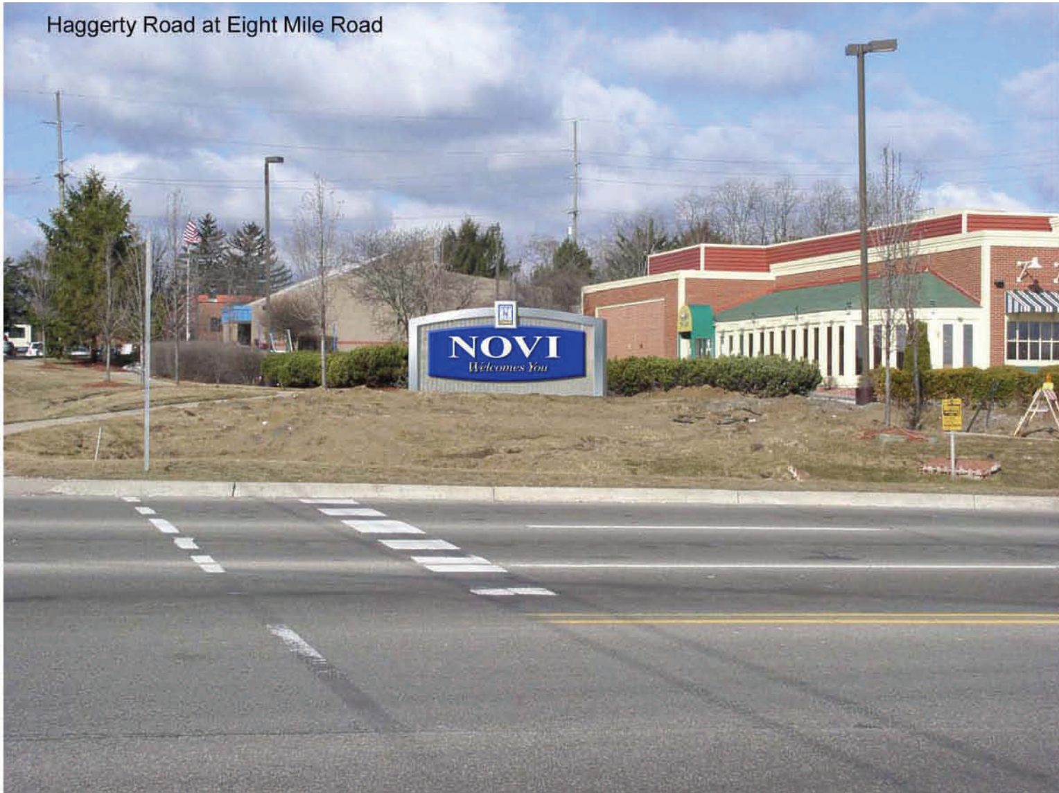
Concept—Primary Sign - Haggerty Road at Eight Mile Road Scale 1/2" = 1'