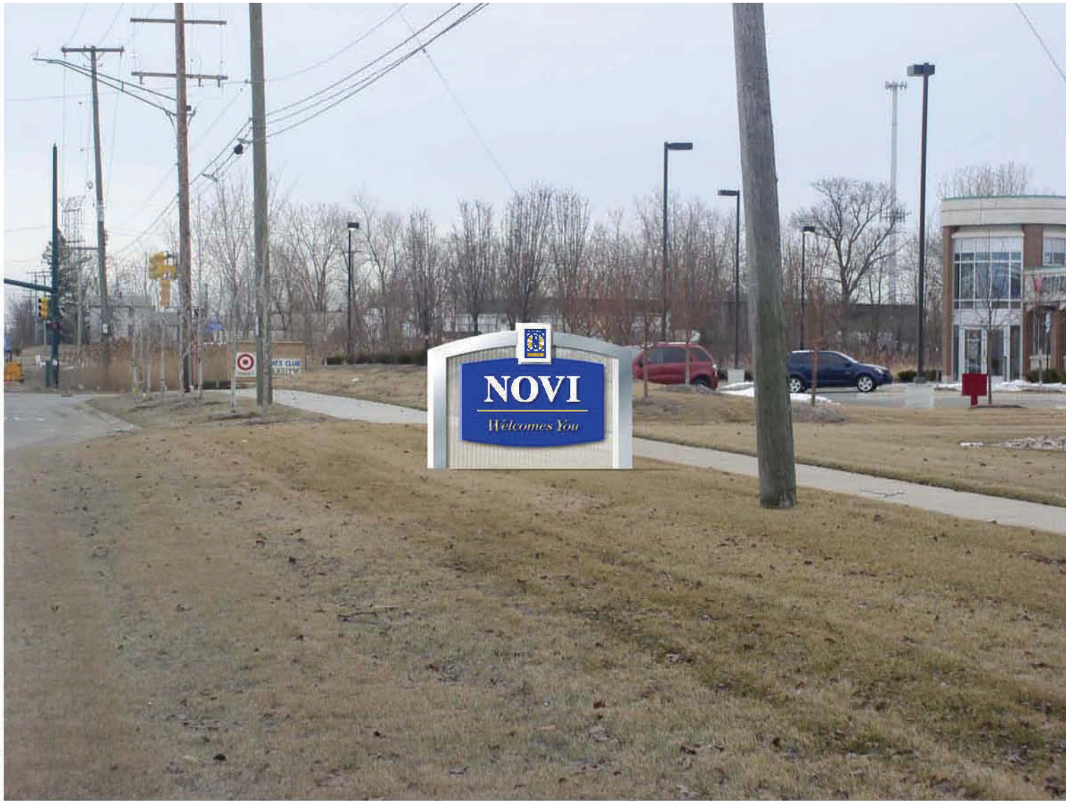
Concept—Monument Sign Grand River Avenue past Wixom Road Scale 1/2" = 1'