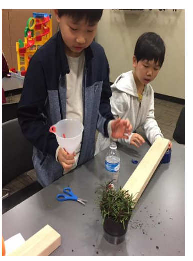
Attendees try to construct a chain reaction using many different materials during the Maker Tween Club.