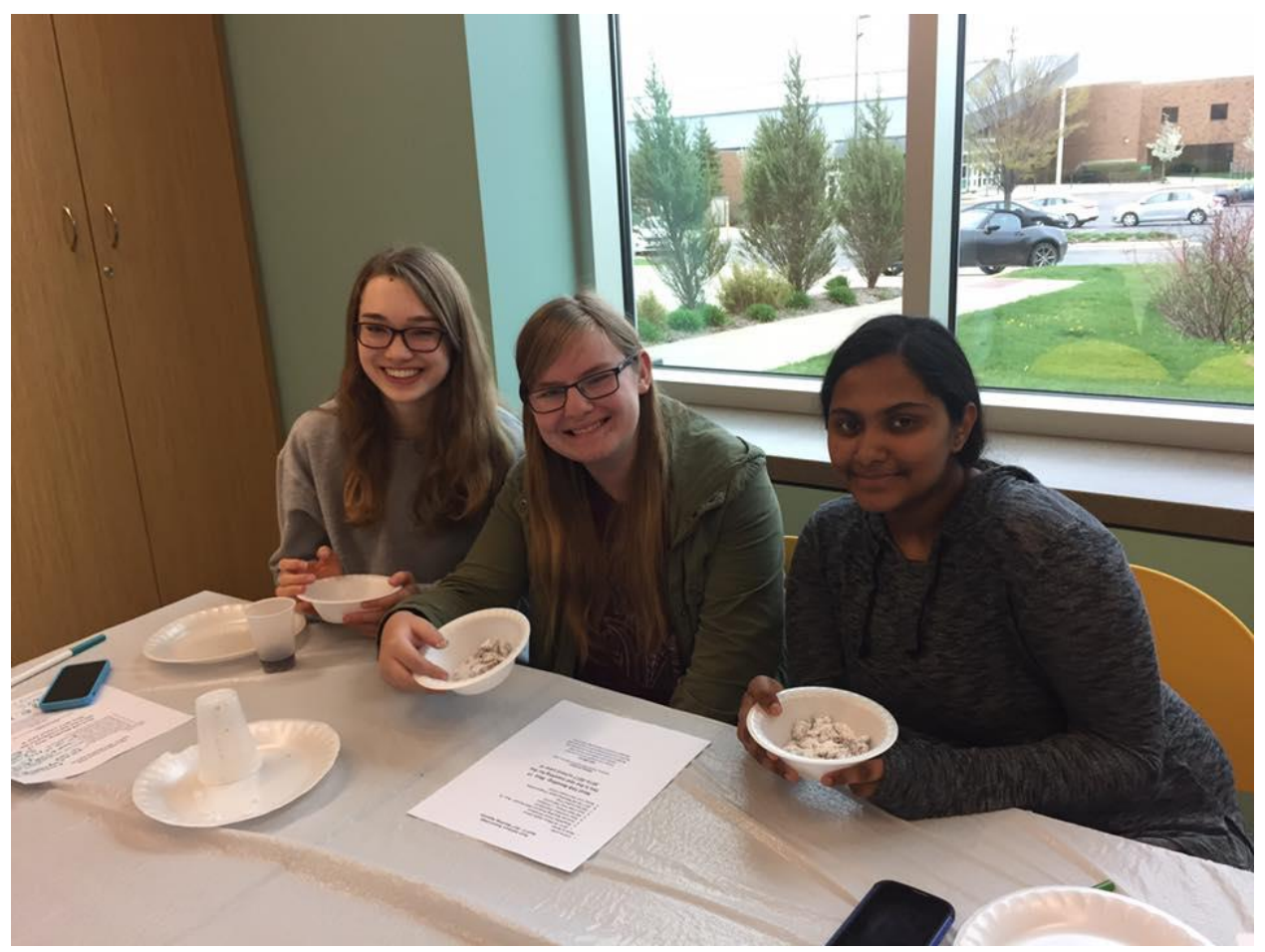
Teen Advisory Board members enjoy puppy chow.