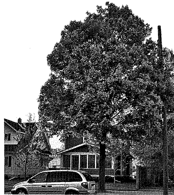
One healthy public tree in its 20th year after planting 1 :