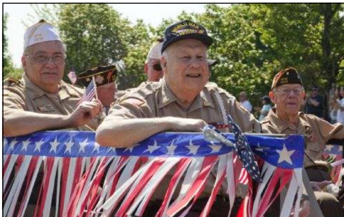
2011 Memorial Day Parade

For more information, contact Rachel Zagaroli at 248.347.0414.