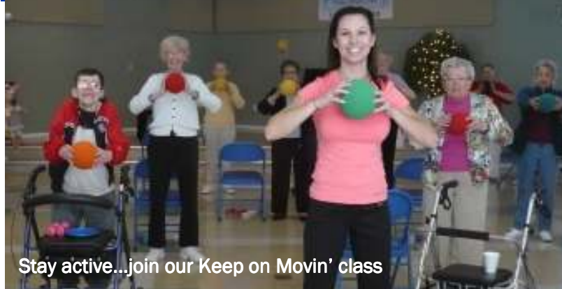
Stay active...join our Keep on Movin' class