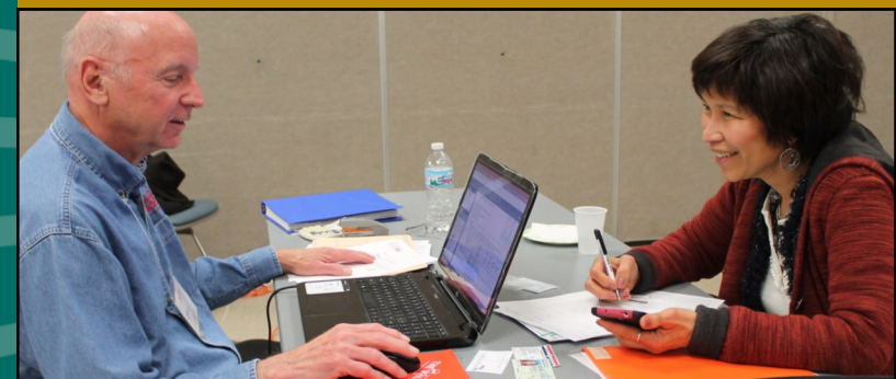
AARP Income Tax Preparation by appointment