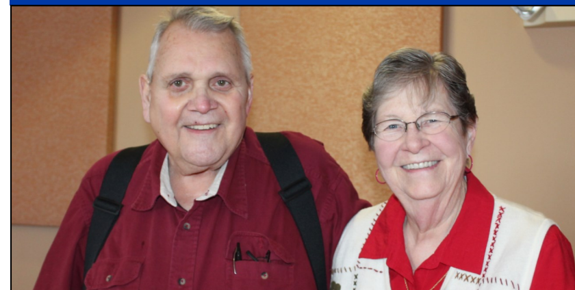
Valentine's Luncheon - Thursday, February 14 - 12-2pm